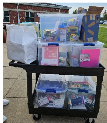
School Supplies Delivered to Riverdale ES