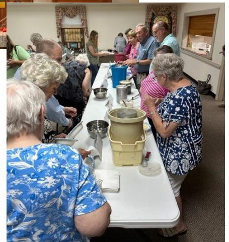
Ice Cream Social