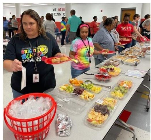
Riverdale Teacher Breakfast