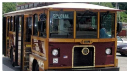
Historical Trolley Tour