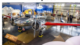
Amelia Earhart Hanger Museum