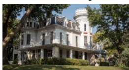
Historical Cray House Tour

We will be taking two consecutive day trips to Atchison, Kansas!