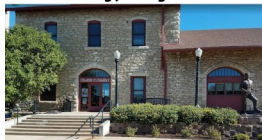
Sante Fe Depot and Train Exhibit