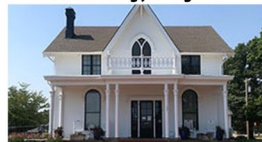
Amelia Earhart Birthplace