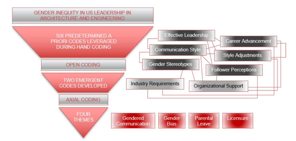
Figure 2 : Data organization and analysis coding process. This figure shows procedural flow for coding and interrelation of codes to produce four themes.

were determined, which codes mapped to, and response data across participants was regrouped according to the relevant theme. Reliability measures included sampling rationale, analyst triangulation, and peer debriefing, as well as an audit trail (Barusch et al., 2011).