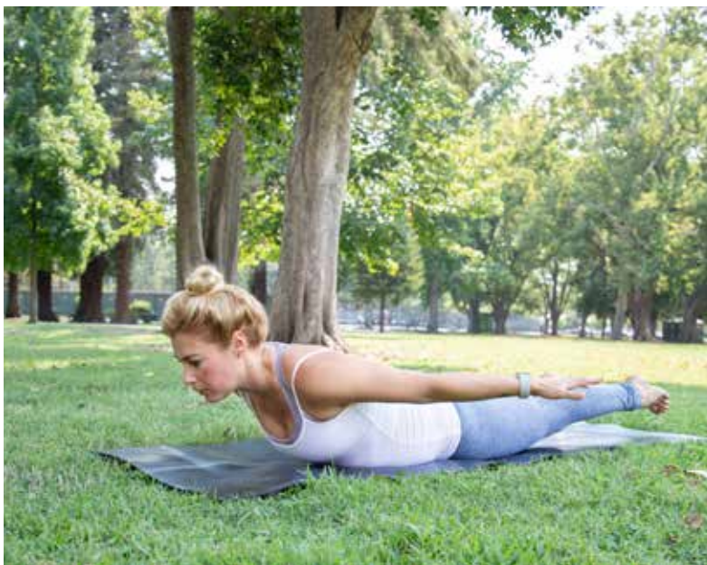
LOCUS POSE - SALABHASANA