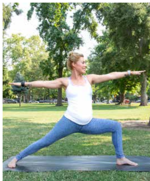
WARRIOR POSE - VIRABHADRASANA