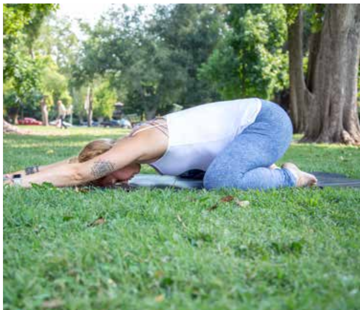
CHILDS POSE - BALASANA