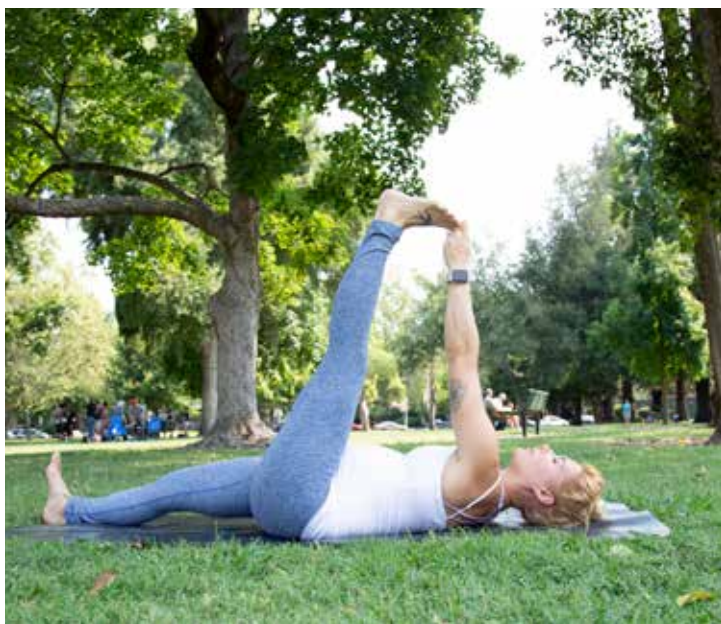
LYING DOWN BIG TOE POSE - SUPTA PADANGUSTHASANA