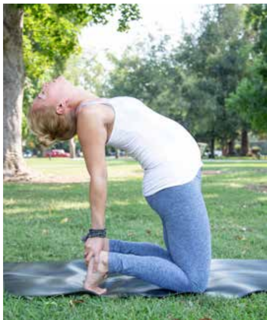
CAMEL POSE - USTRASANA