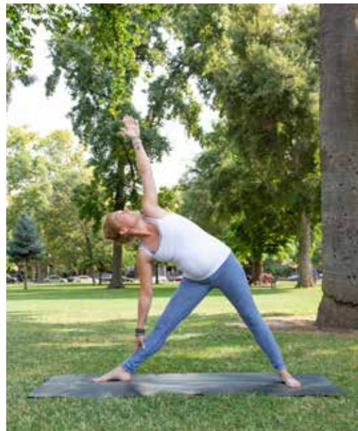
TRIANGLE POSE - TRIKONASANA