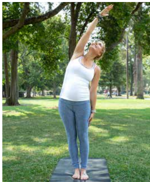
HALF-WAIST BENDING - ARKHAKATI CHAKRASANA