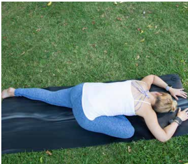
HALF PIGEON POSE - KAPOTASANA