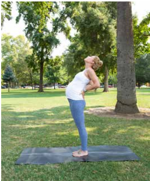
BACKWARD BENDING - ARDHA CHAKRASANA