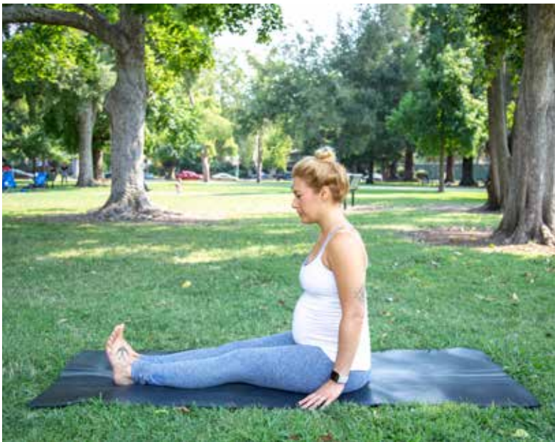
STAFF POSE - DANDASANA