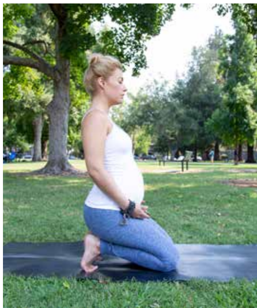
KNEELING MEDITATION POSE - SEIZA OR VAJRASANA