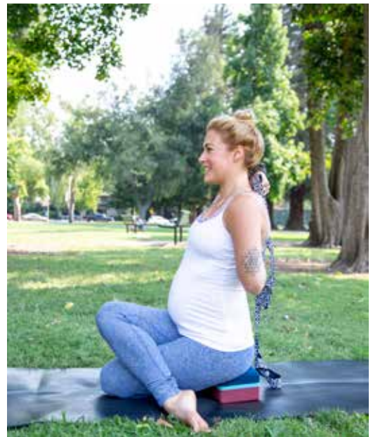
HEAD OF THE COW - GOMUKHASANA