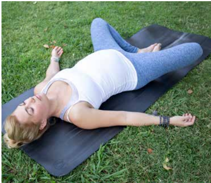
RECLINED BOUND ANGLE POSE - SUPTA BADDHA KONASANA