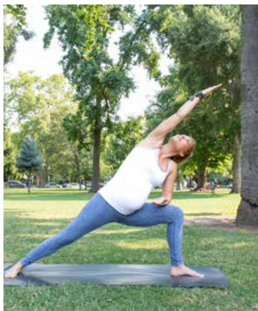
SIDE ANGLE POSE - PARSVAKONASANA