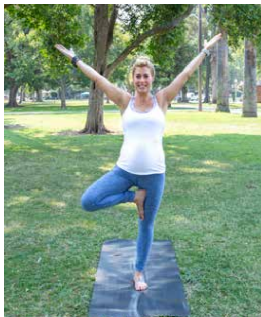
TREE POSE - VRIKSHASANA