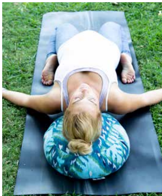
SADDLE POSE - SUPTA VIRASANA