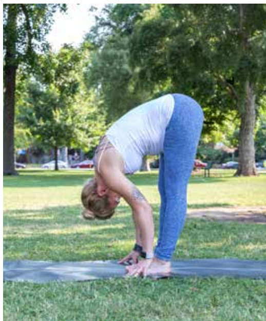
FORWARD BENDING - PADAHASTASANA