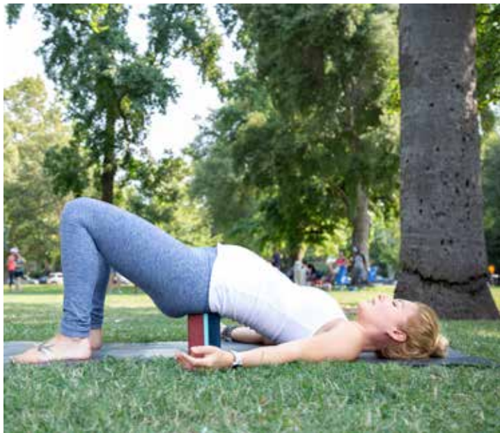
SUPPORTED BRIDGE - DANDASANA