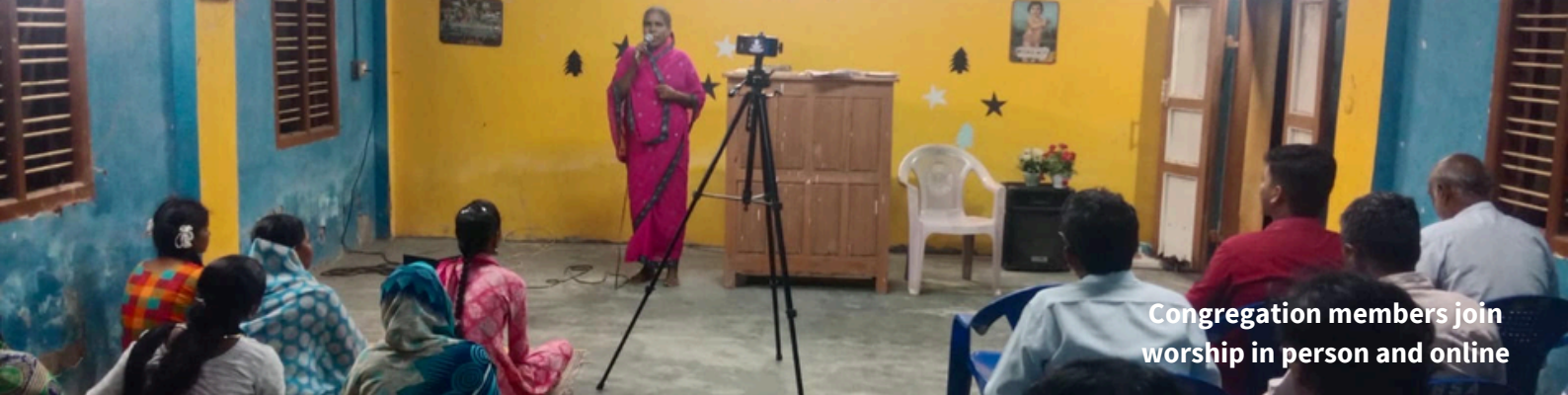
Congregation members join worship in person and online