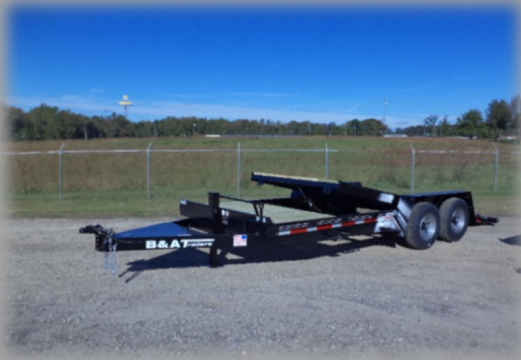
HD DOUBLE STACK CHANNEL FRAME