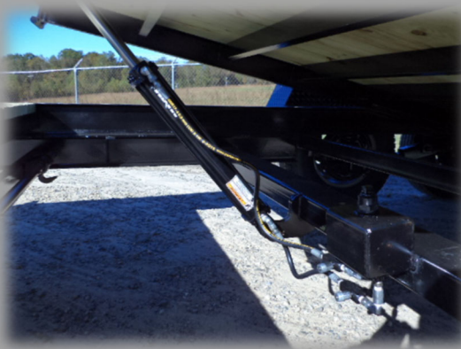
HYDRAULIC GRAVITY FEED CUSHION CYLINDER W/ CONTROL SPEED