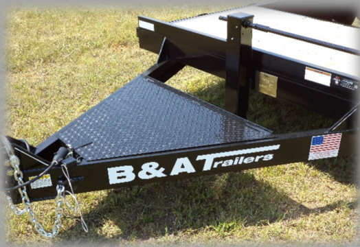
LOCKING LID TOOL TRAY, 12K JACK SEALED WIRING, LED LIGHTS