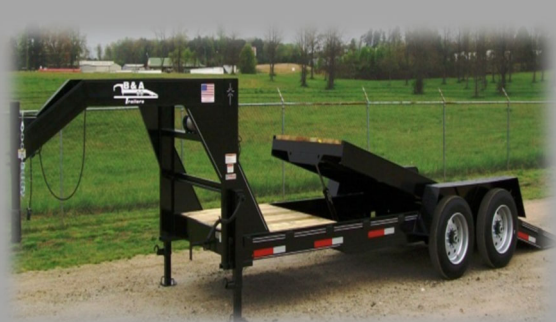
GOOSENECK PACKAGE OPTION