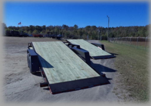
EASY LOAD FULL WIDTH LOAD ANGLE HD "B&A BUILT™" FENDERS