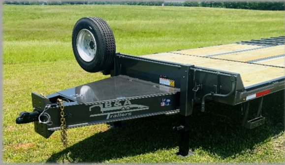
TOOL TRAY, SEALED WIRING, 12K JACK LED LIGHTS, BOARDING STEP