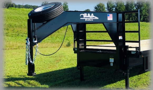
GOOSENECK PACKAGE AVAILABLE CROSSMEMBERS 16" ON CENTER