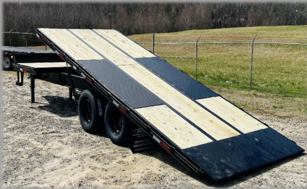
EASY LOAD APPROACH ANGLE