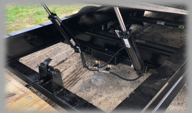
TWIN CYLINDER W/ B&A LATCH