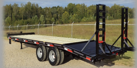
102" WIDE X 34" DECK HEIGHT