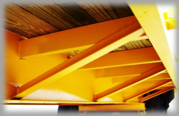
12" PIERCED FRAME, 3" CHANNEL CROSSMEMBERS 16" ON CENTER