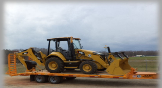
MADE FOR THE LONG HAUL