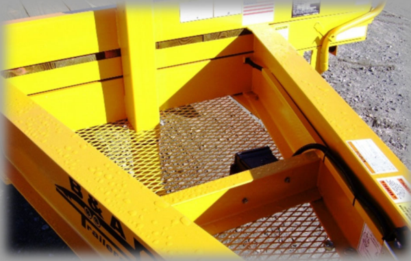
TOOL TRAY, SEALED WIRING, 12k JACK LED LIGHTS, BOARDING STEP