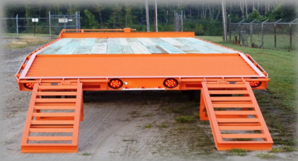
EASY LOAD SPRING ASSIST RAMPS