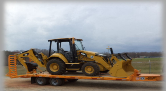
MADE FOR THE LONG HAUL