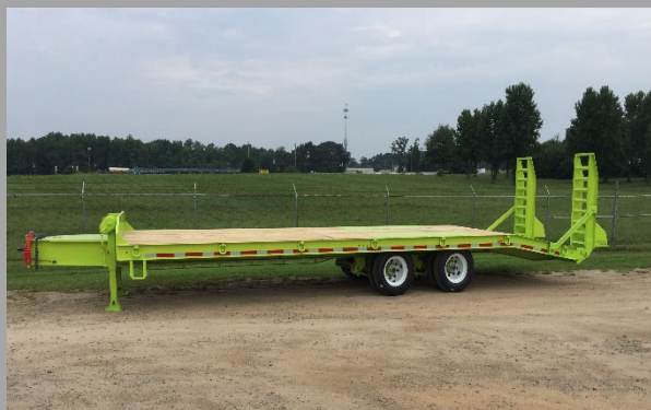
MANY CUSTOM OPTIONS & COLORS