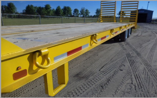
HD D-RINGS & BOARDING STEP