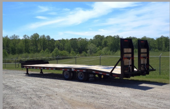
AIR RAMP PACKAGE OPTION