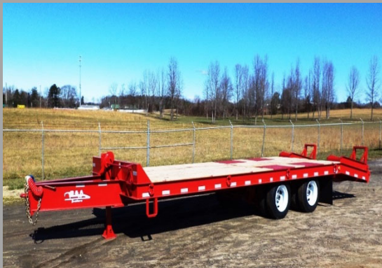
HD DUAL-SPEED JACK LOCKING LID ON TOOL TRAY