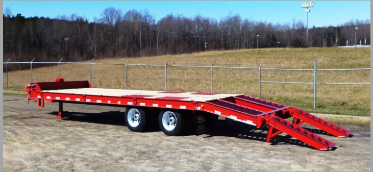
HD CHECKER-PLATE FENDERS & HD RAMP