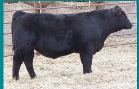
Lot 48 – PAV MR BLACKHAWK G900