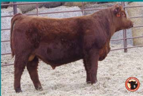
Lot G20 – WSM DOMAIN 919G

Larry, Payton and Teigan Pavlenko Payton: (701) 495-1168