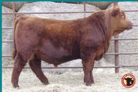
Lot G1 – WSM COWBOY 911G