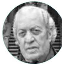
Contributor Timothy Baum