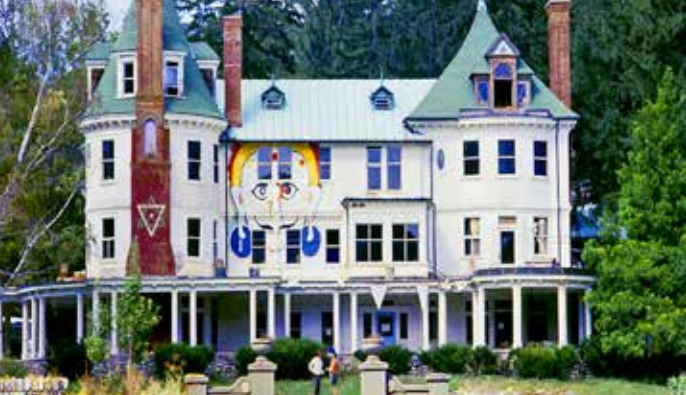
Hitchcock Mansion, Millbrook, New York