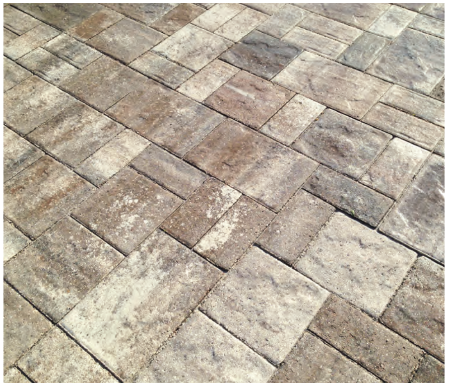
Heritage in White / Tan / Charcoal, Random Pattern