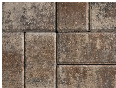
White / Tan / Charcoal