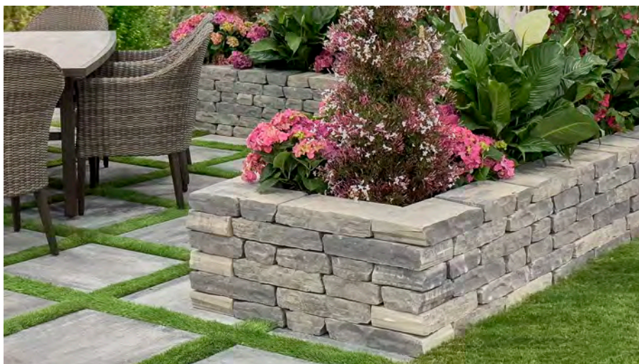
Ladera™ Wall in White Pewter

Extend your outdoor living space with contemporary, yet subtly natural style using the Ladera™ wall block. The Ladera™ wall block measures approximately 3 in. H x 16 in. W x 8 in. D and can be configured to define or supplement your outdoor living space - whether you're building planter walls and borders or creating columns and fire pits to extend your outdoor living area. These environmentally friendly wall blocks are low maintenance and easy to install, no matter the project.