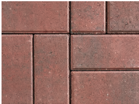
Red / Charcoal