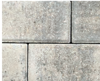
White / Pewter