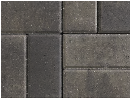
Gray / Charcoal