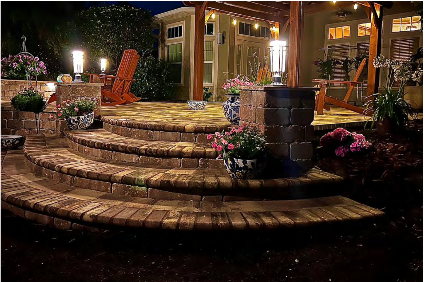
Victory Pavers & Stonegate® Wall and Coping in Cream / Beige / Charcoal