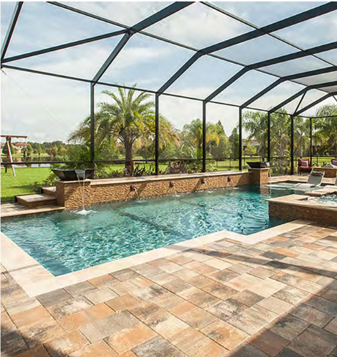
Victory Paver in Cream / Beige / Charcoal, Random Pattern