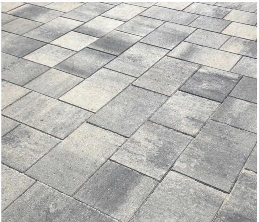
Victory in White / Pewter, Random Pattern