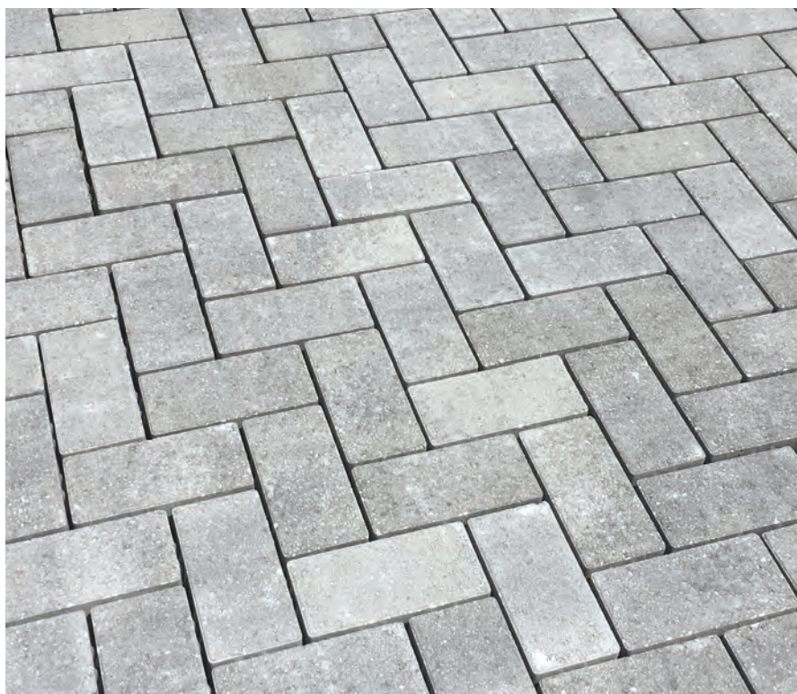
Eco-CityLock® in White / Pewter, Herringbone Pattern