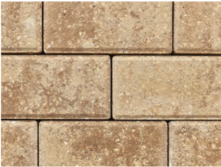
Cream / Beige