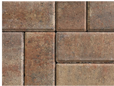
Cream / Orange / Pewter