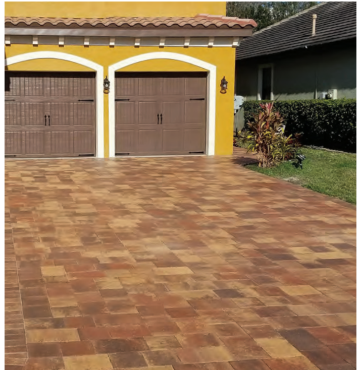
Victory in Indian Summer, Random Pattern