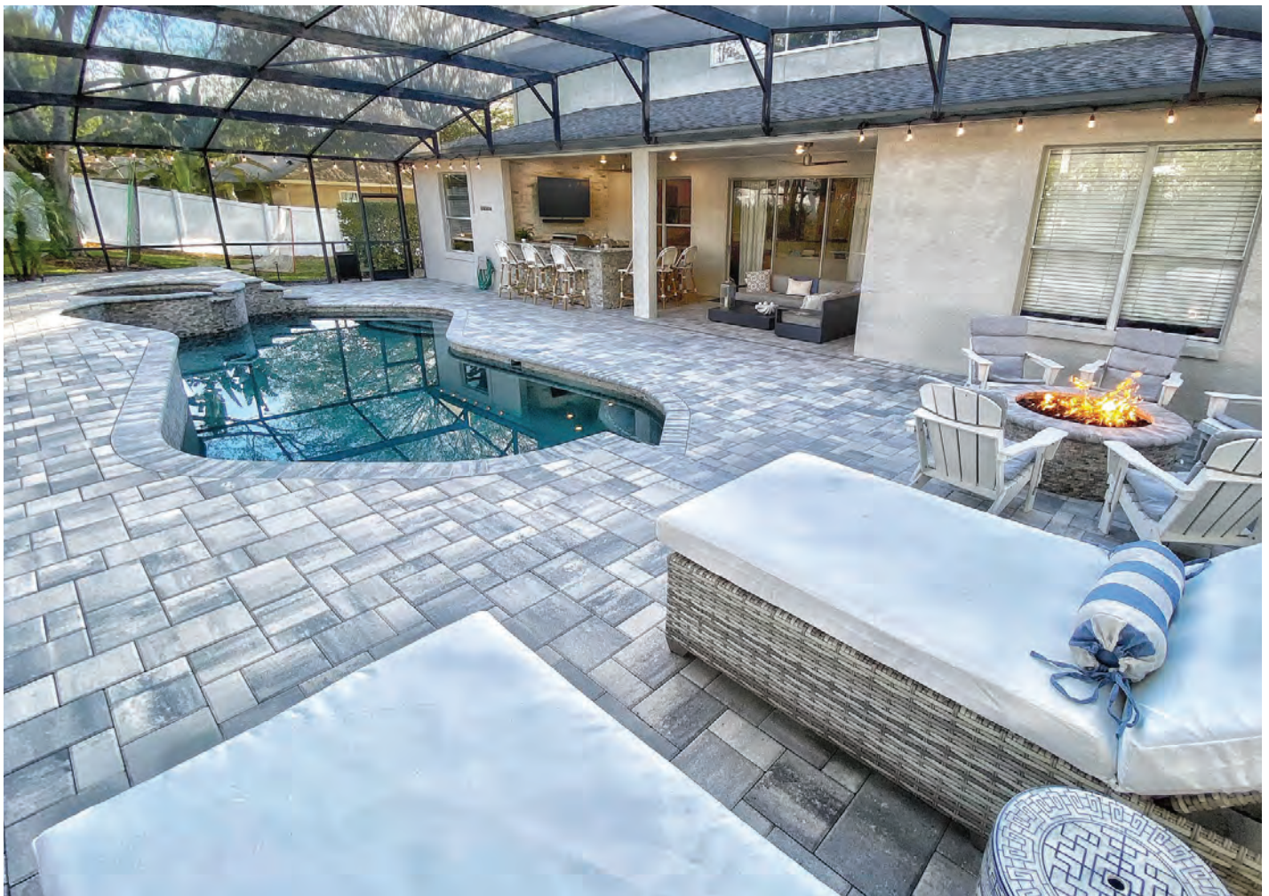
CityStone™ in White / Pewter, Random Pattern