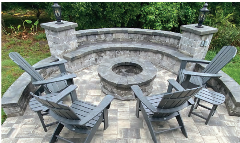
Stonegate® in Gray / Charcoal