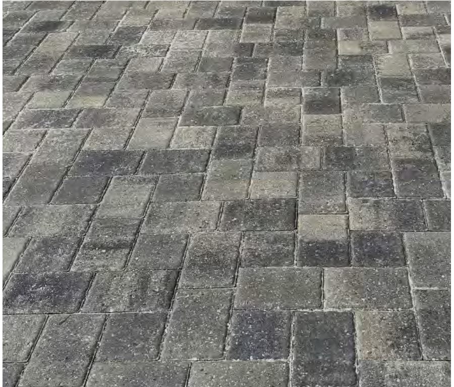
Union in Gray / Charcoal, T-Pattern