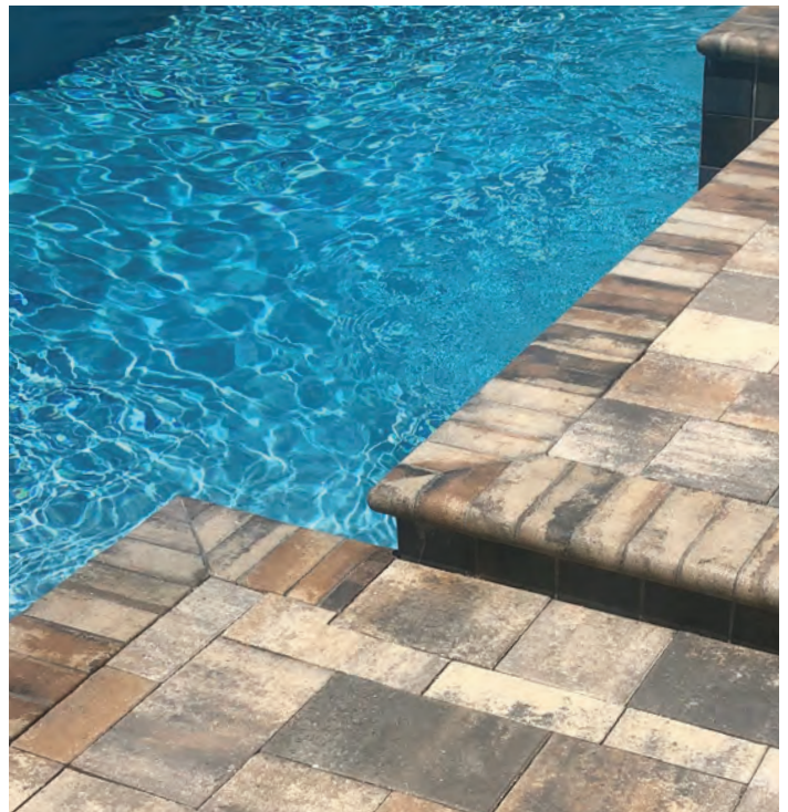
Victory and Coping in Cream / Beige / Charcoal