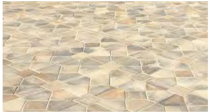
Monument and Commonwealth in Cream / Beige / Charcoal