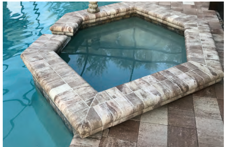
4" Remodel Coping, White / Tan / Charcoal