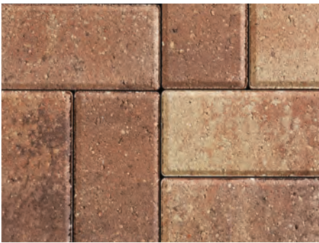
Cream / Orange / Brown