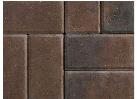
Tan / Charcoal