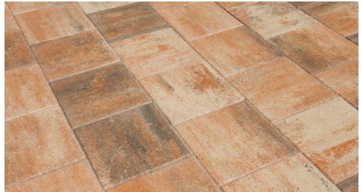
Supreme in Cream / Orange / Pewter, Running Bond Pattern