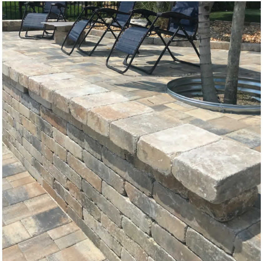
Munich Wall in Cream / Beige / Charcoal