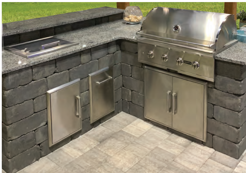
Stonegate® Grill Station in Gray / Charcoal