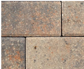
Cream / Orange / Pewter