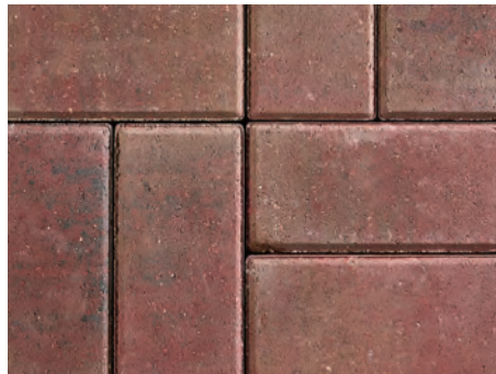
Red / Tan / Charcoal