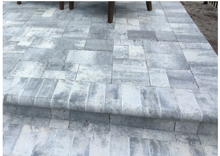
Bullnose Coping in White / Pewter, Step Application