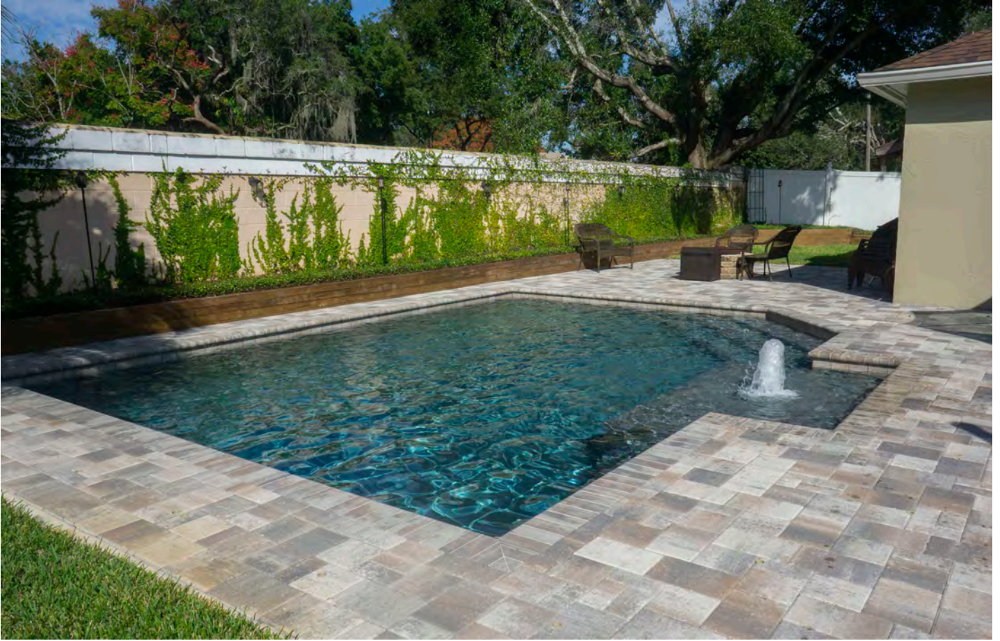
Victory Paver in White / Tan / Charcoal, Random Pattern