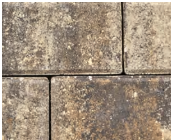
Cream / Beige / Charcoal