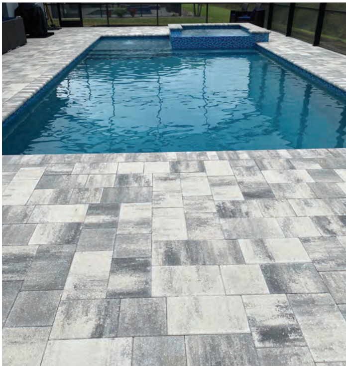
Victory and Coping in White / Pewter Random Pattern Paver