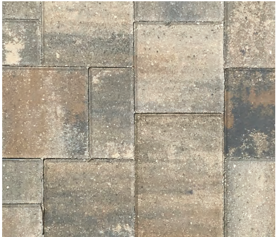
CityStone™ Demi in Cream / Beige / Charcoal, Random Pattern