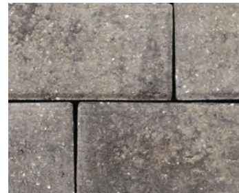
Gray / Charcoal