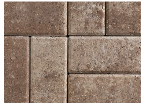
White / Tan

Due to expected variations of the natural raw materials used in the production of these products, minor shade variations may occur between samples including material samples, photography, printed images, computer images and orders. Please make your color