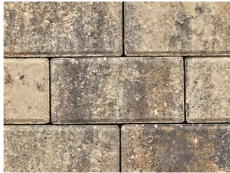
Cream / Beige / Charcoal