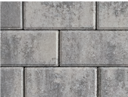
White / Pewter