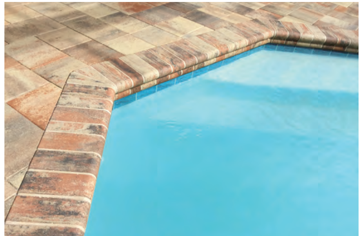
2 3 / 4 " Remodel Coping, Cream / Orange / Pewter