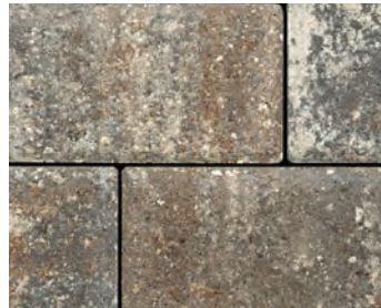
White / Tan / Charcoal