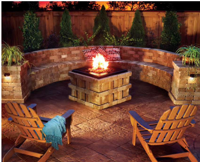
RumbleStone® Bench and Fire Pit in Café

Flagstone's innovative RumbleStone® provides a set of rustic building blocks for your outdoor hardscape projects. Simple to complex, large or small, the possibilities for creative expression are as far and wide as your imagination. The six tumbled RumbleStone® sizes modulate in all dimensions and can be assembled in a variety of configurations and orientations. In addition to simple running bond patterns, the stones can be easily stacked with insets, moved forward and backward, horizontally and vertically, for more aesthetically pleasing visual relief and texture. Also, the 3.5-inch base module works with common dimension lumber for benches and pergola posts. Stack 'em up and bond with construction adhesive.