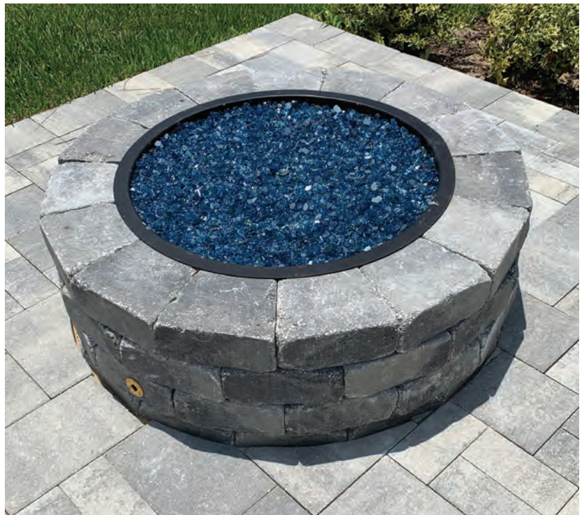
Fire Pit Brick in Gray / Charcoal