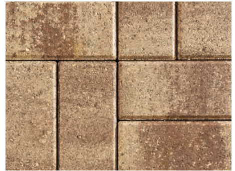
Cream / Tan