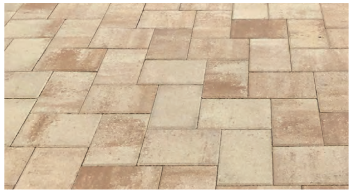
Independence in Cream / Beige, Herringbone Pattern