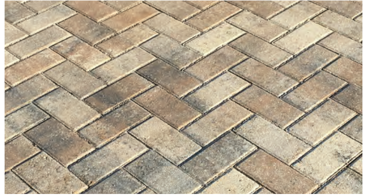
Freedom in Cream / Beige / Charcoal, Herringbone Pattern

SUPREME Unit Size 16" x 16" Thickness: 60mm