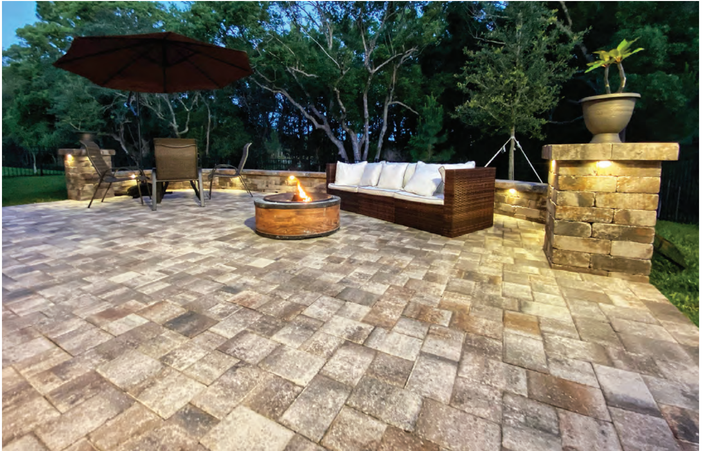
Union in White / Tan / Charcoal in Random Pattern & Munich Wall and Cap