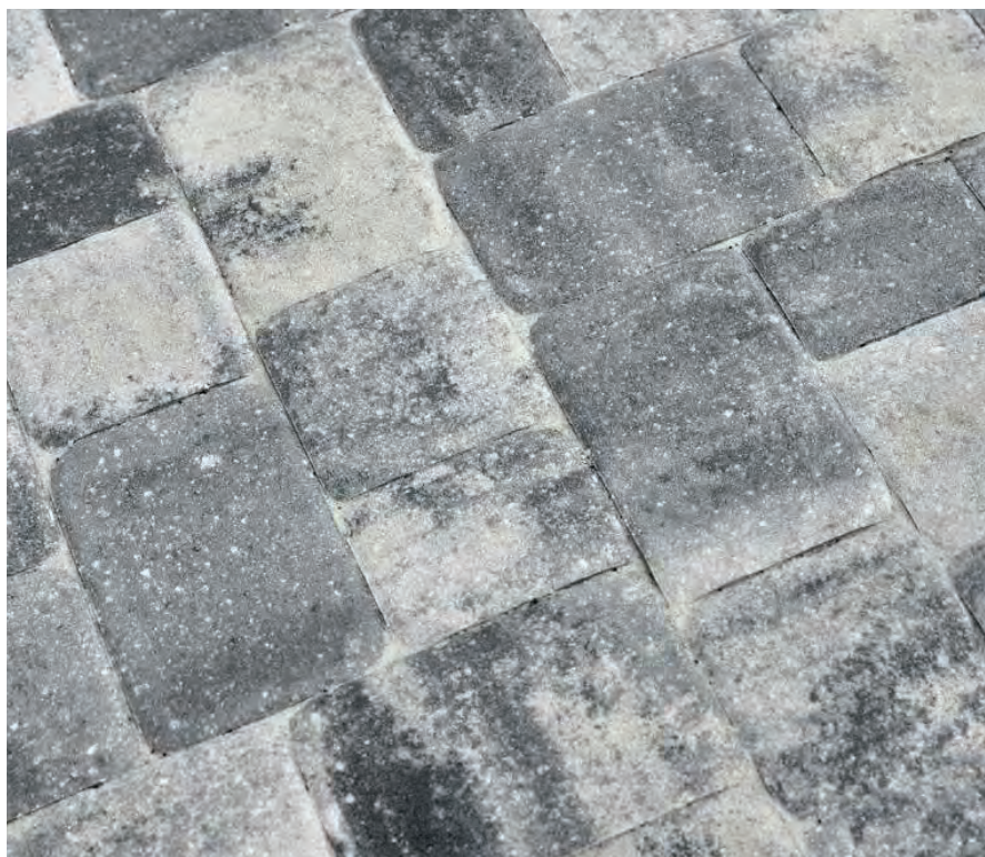
Castlerock III in White / Pewter, Random Pattern