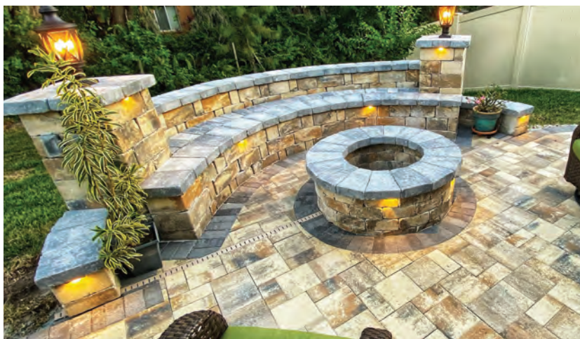
Stonegate® in Cream / Beige / Charcoal