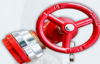
FIRE HYDRANT SYSTEM