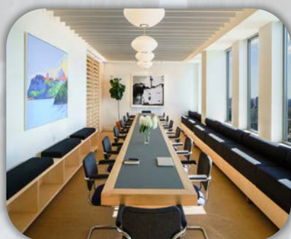
BOARD ROOM SOLUTIONS