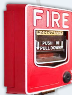
FIRE ALARM SYSTEM