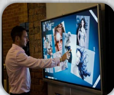
LFD & INTERACTIVE PANEL