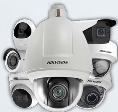
CCTV SURVEILLANCE SYSTEM