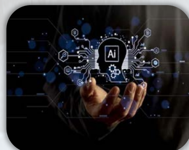
AI-BASED CUSTOMIZE SOLUTIONS