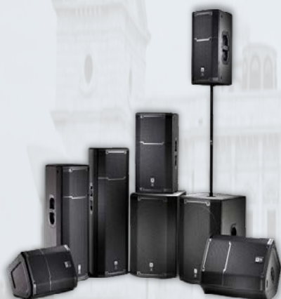
PROFFESIONAL SOUND SYSTEM