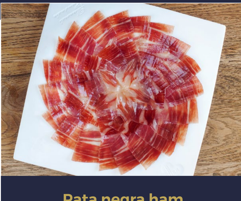
Pata negra ham + Master cutter 430£