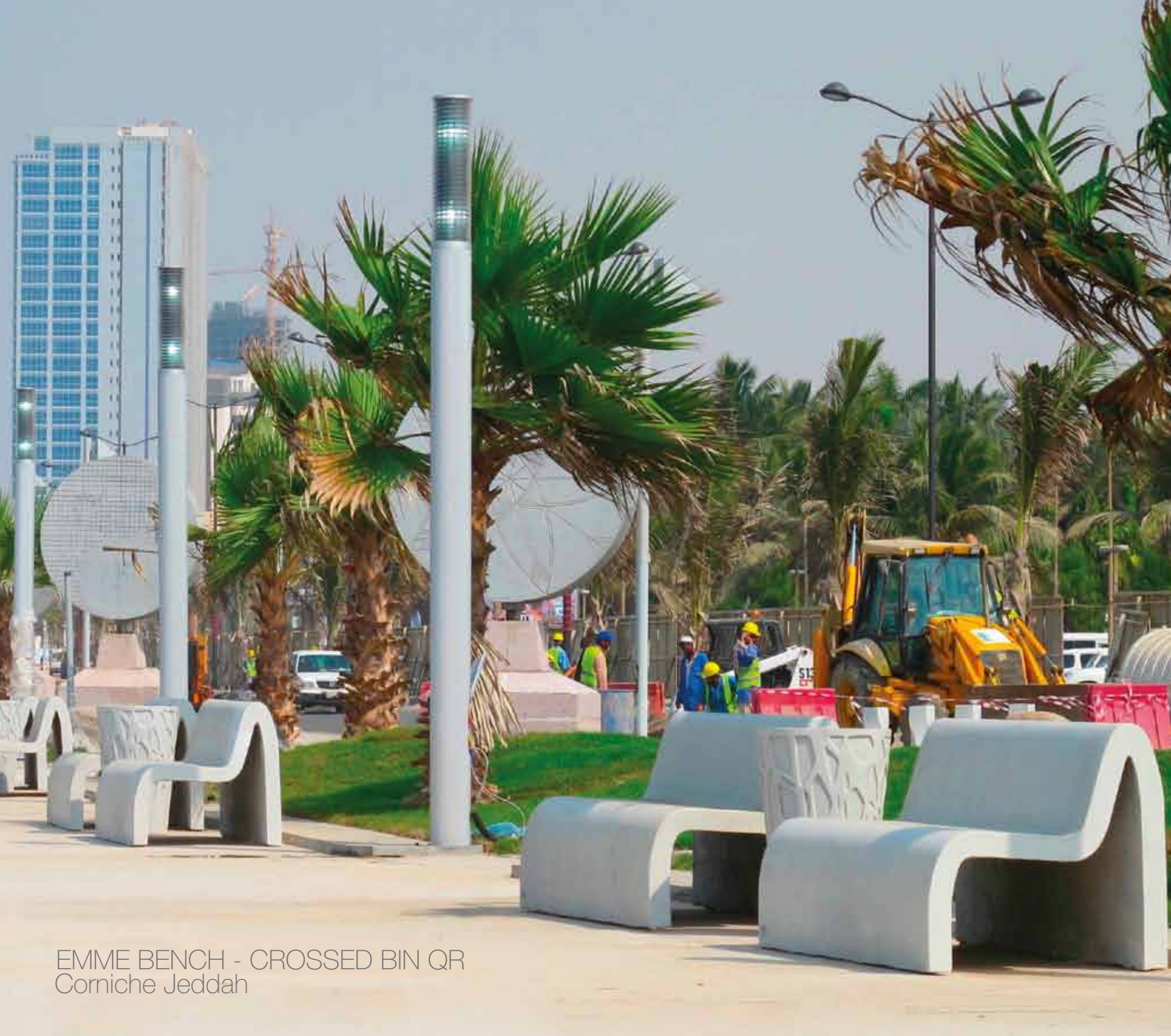
EMME BENCH - CROSSED BIN QR Corniche Jeddah