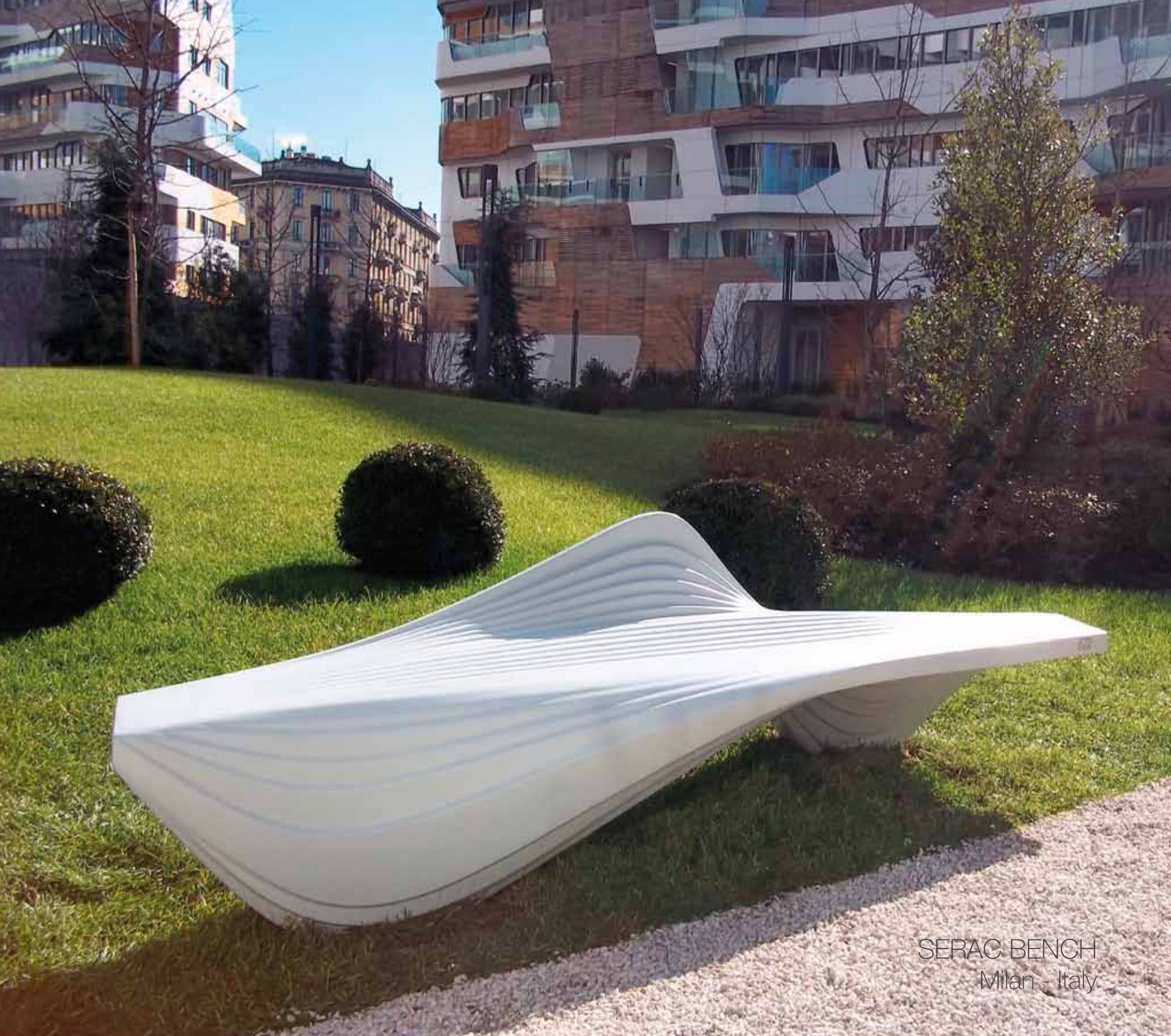
SERAC BENCH Milan - Italy