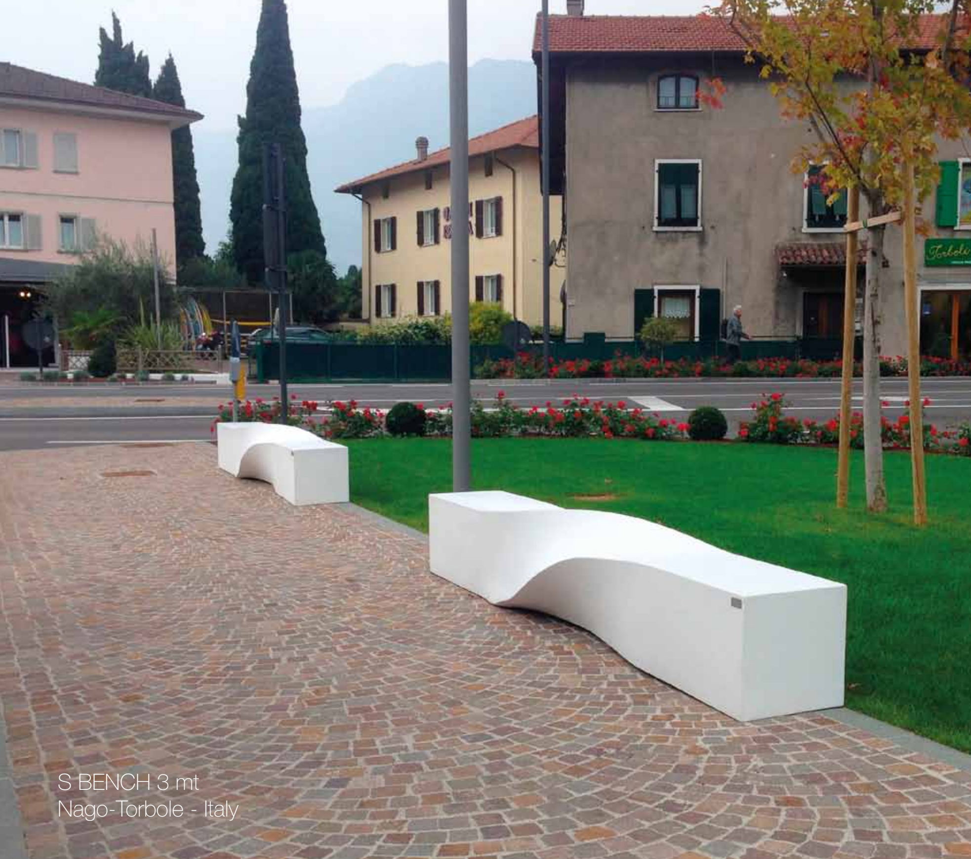
S BENCH 3 mt Nago-Torbole - Italy