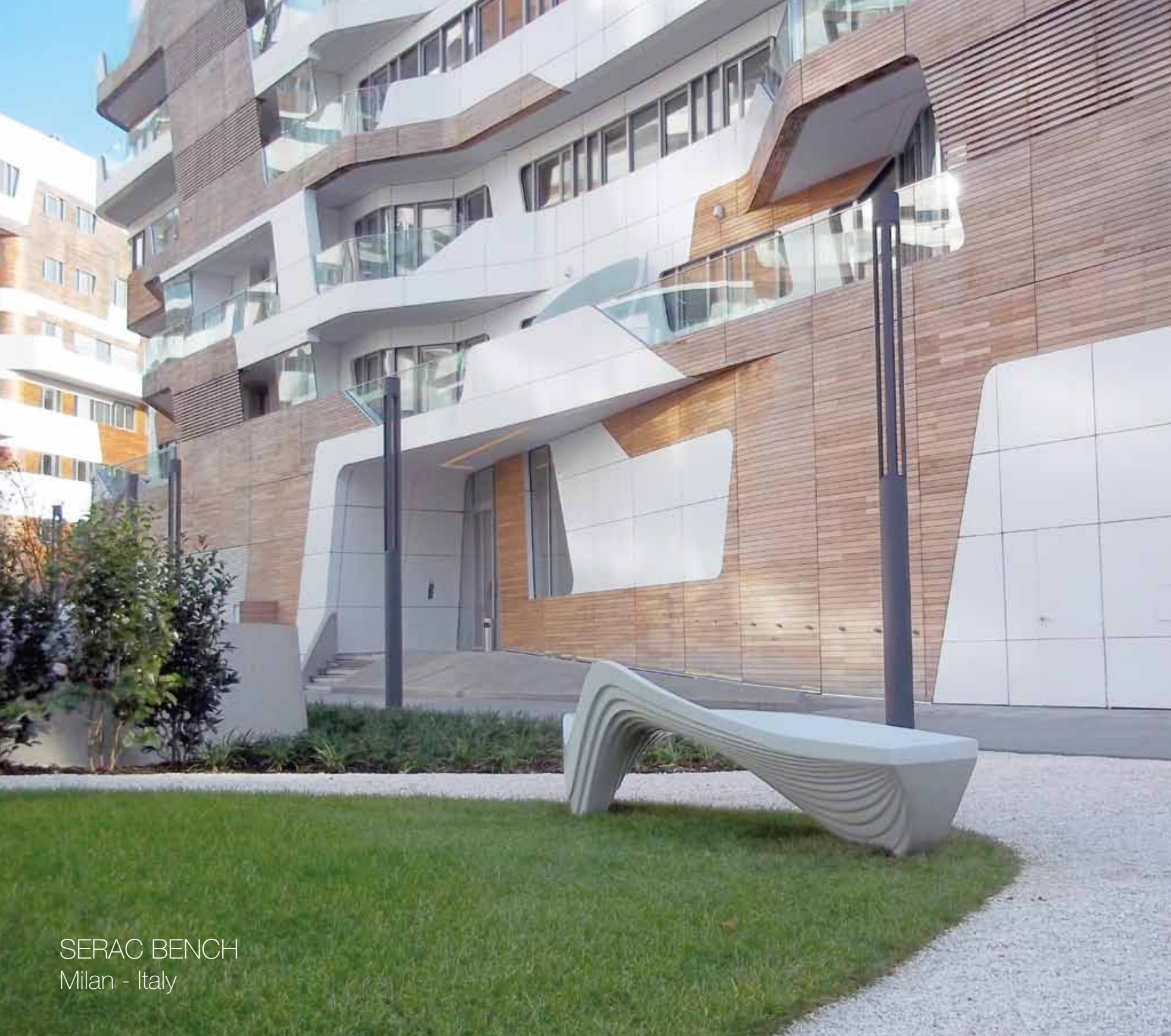
SERAC BENCH Milan - Italy