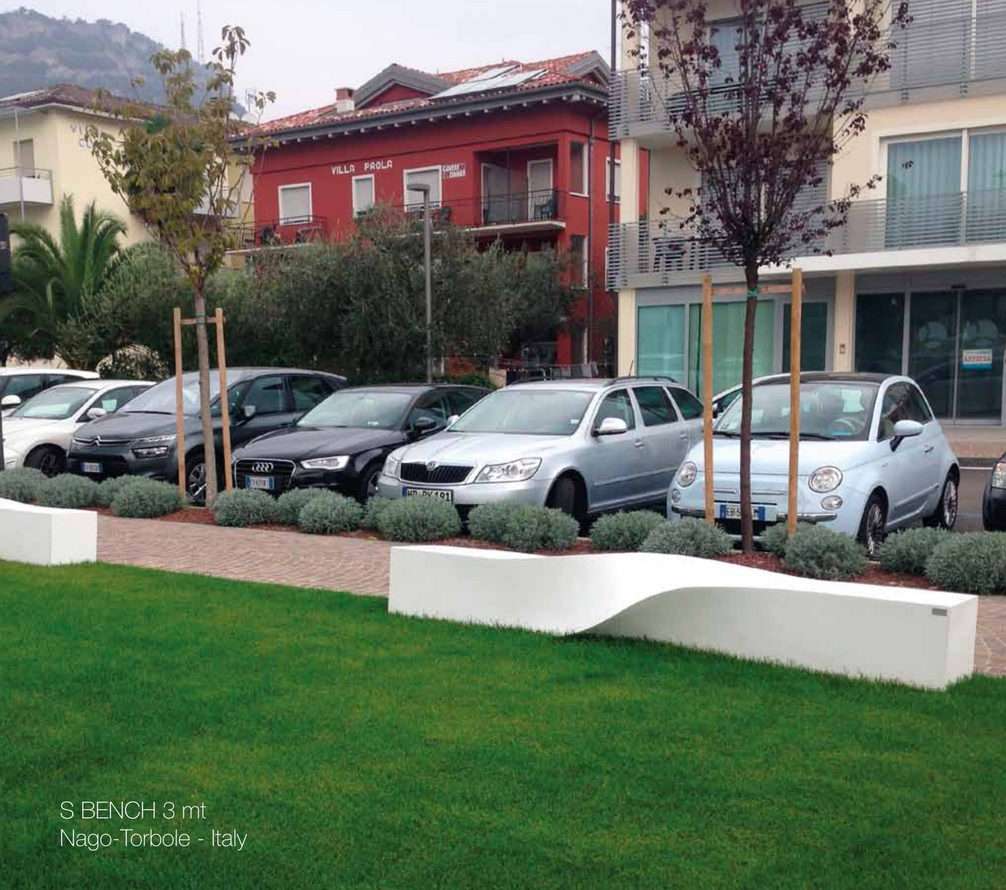
S BENCH 3 mt Nago-Torbole - Italy