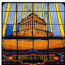
Ordo Ab Chao