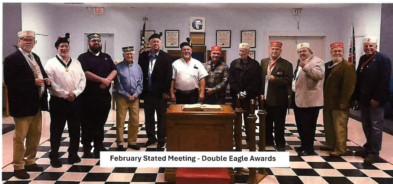
February Stated Meeting - Double Eagle Awards