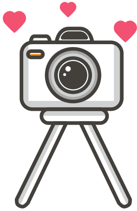
School Pictures September 29th Retakes November 8th