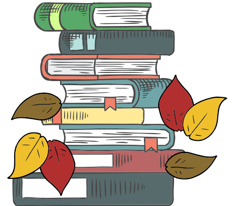
Fall Book Fair November TBA