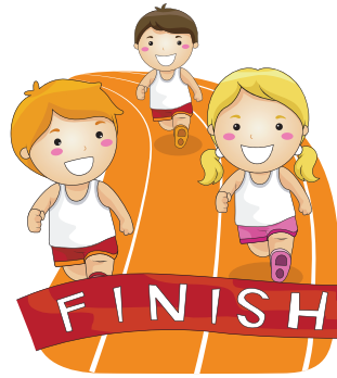
Desert Dash Sabino Canyon October 1st