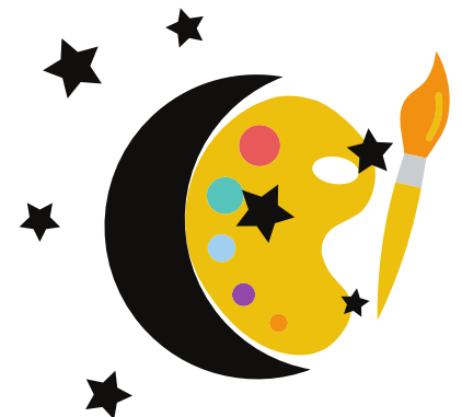
Family Evening of the Arts May TBA