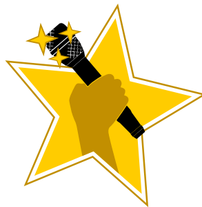
Variety Show April Chair needed