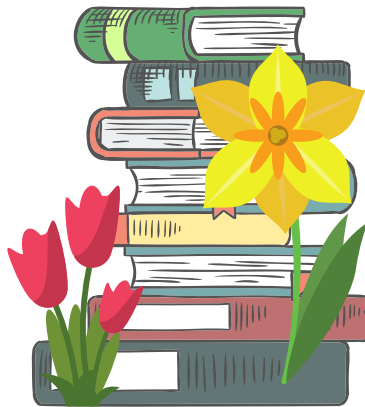
Spring Book Fair March TBA