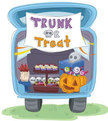
Trunk or Treat October 28th