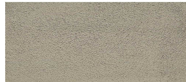
Sand Finish Acrylic Stucco