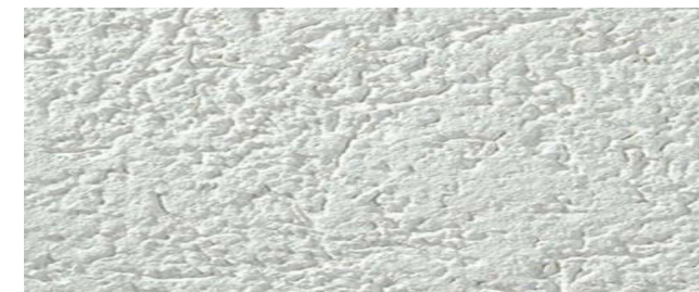
Swirl Finish Acrylic Stucco