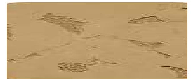
Cat Face Finish Acrylic Stucco