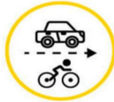
Ride with Traffic