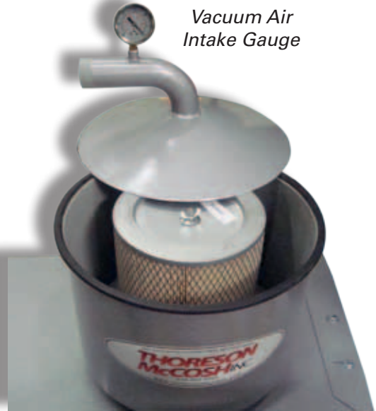
Vacuum Air Intake Filter Housing with easy access Filter Cartridge