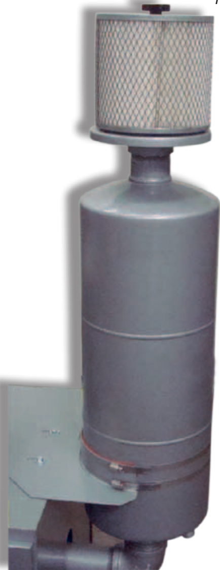
Premium Duty Rated Vacuum Discharge Air Silencer

This modular equipment has been designed for standard material handling configurations but can be customized to suit your specific needs and requirements. The centralized vacuum source eliminates the need for "Press Side" auxiliary units. Whether it's for Injection Molding, Blow Molding or Extrusion applications, these units are durable enough for any situation.