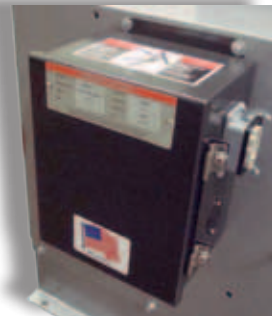
Motor Starter Box with Communication Port