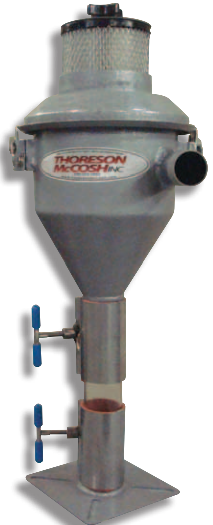
Tornado Material Loader

The Tornado Material Loader provides low-cost, reliable material loading. Utilizing compressed air, this powerful compact loader transfers material from bags, barrels, or gaylords and loads it directly into a variety of machines or storage units. Mounted onto the machine throat, this combination loader and hopper is capable of loading up to 250 lbs. per hour. Used on storage hoppers, the Tornado can deliver 500 lbs. per hour plus!