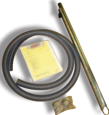
Loader Accessories Kit Included