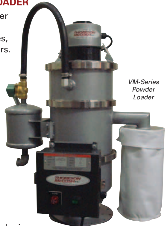
VM-Series Powder Loader

This unique model is designed with Quick-Release Lid-Clamps for simple maintenance, making tools unnecessary.