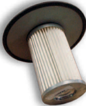
VMIBP Internal Filter Cartridge