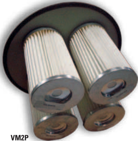
VM2P Internal Filter Cartridge Assembly