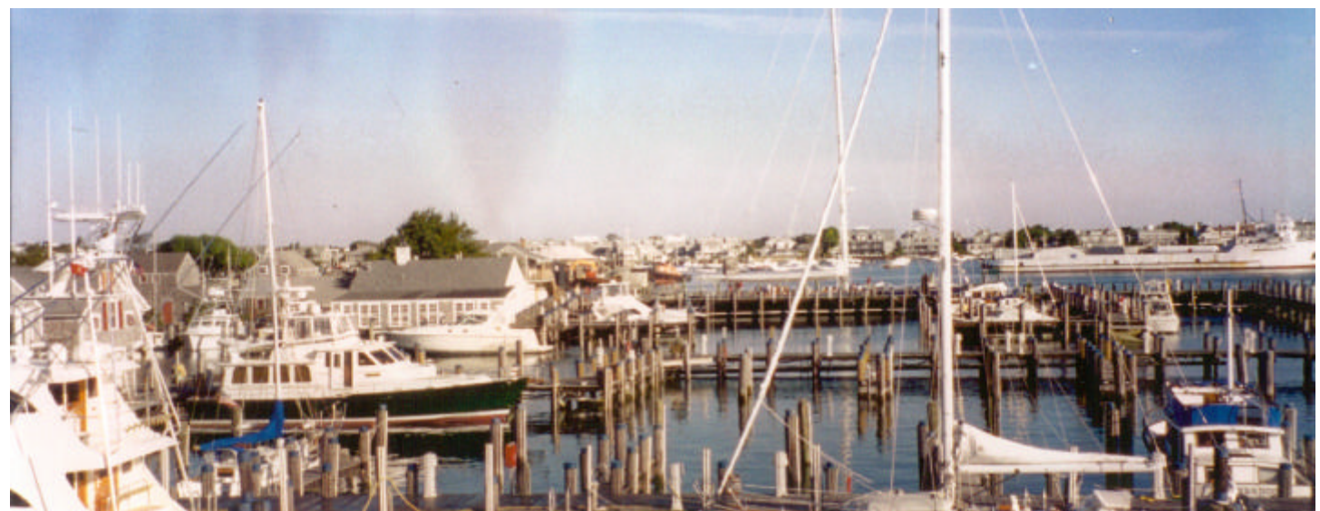
View from TINKNOCKER's Tuna Tower overlooking Nantucket Harbor

September 14, 15, 16, 2002 Norton's Marina East Greenwich RI