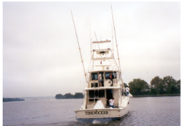
Leaving Gangplank Marina

Left Dock 9:00am Gangplank Marina Washington D.C. Arrive Dock 5:30pm Point Lookout Marina Ridge, Maryland