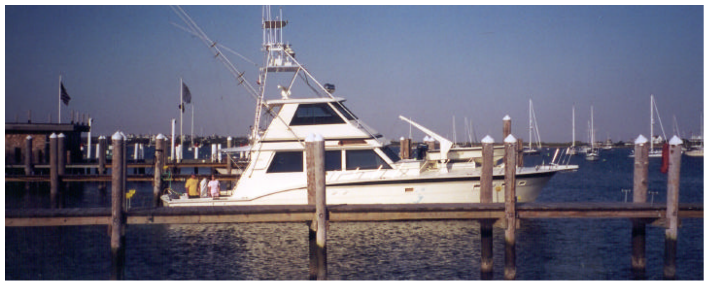
TINKNOCKER docked at Champlain's Marina on Block Island