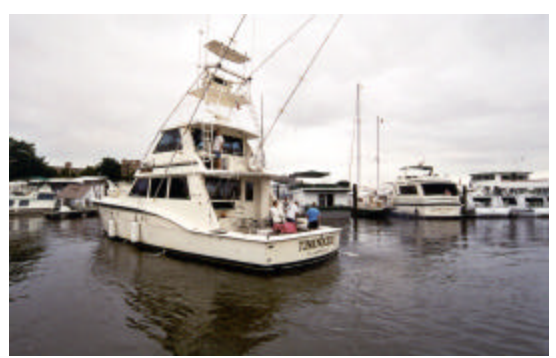
TINKNOCKER arriving at Gangplank Marina

Left Dock 9:20AM Windmill Point, North Carolina Arrive Dock 5:45pm Gangplank Marina Washington D.C.