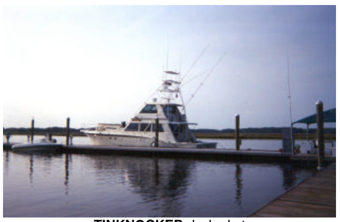
TINKNOCKER docked at

Arrive Dock 6:30 pm Swan Point – Sneads Ferry, North Carolina