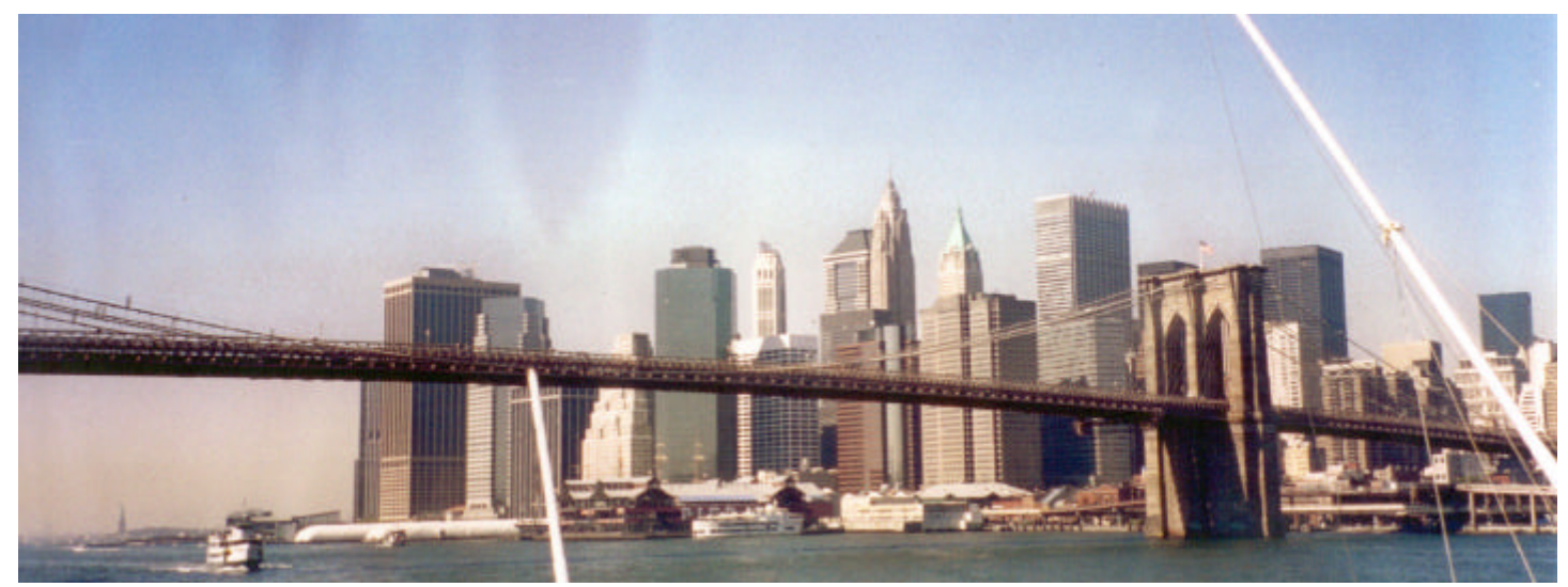
Heading up the East River with Statue of Liberty & Manhattan in view. Just passing Brooklyn Bridge

Arrive Dock Port Jefferson Marina-Port Jefferson, New York