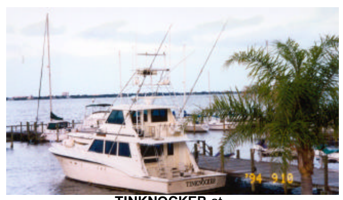
TINKNOCKER at Intercoastal Marina, Melbourne, FL

Arrive Dock 6:00 pm Camachee Cove Marina - St. Augustine, Florida