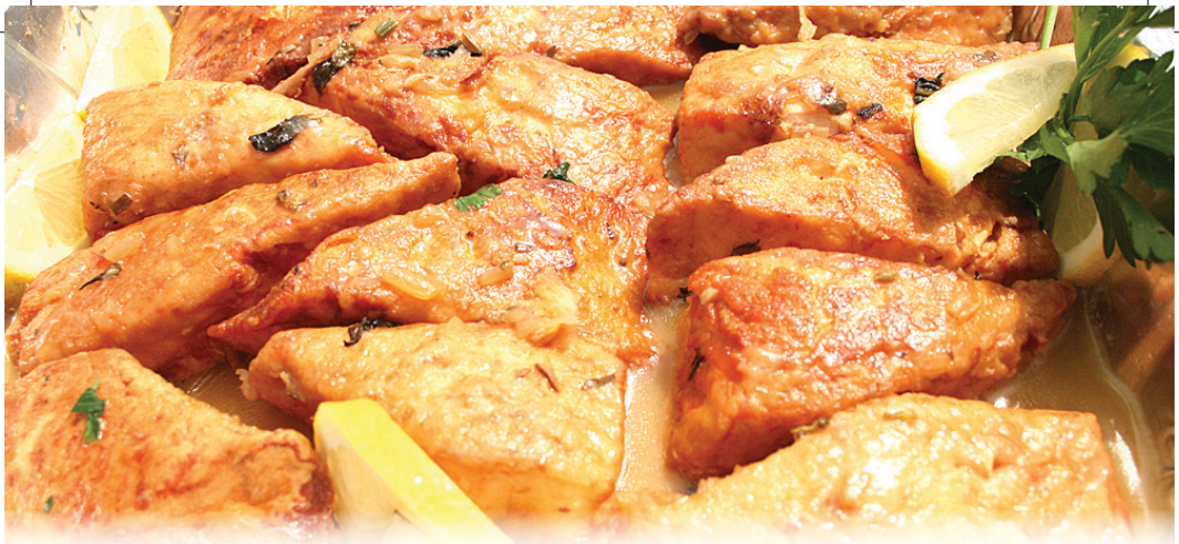
Salmone al Vino Bianco