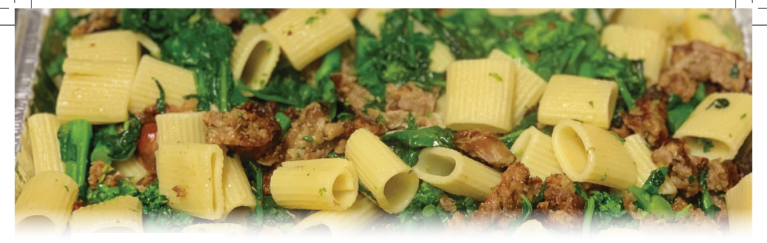
Rigatoni con Salsiccia