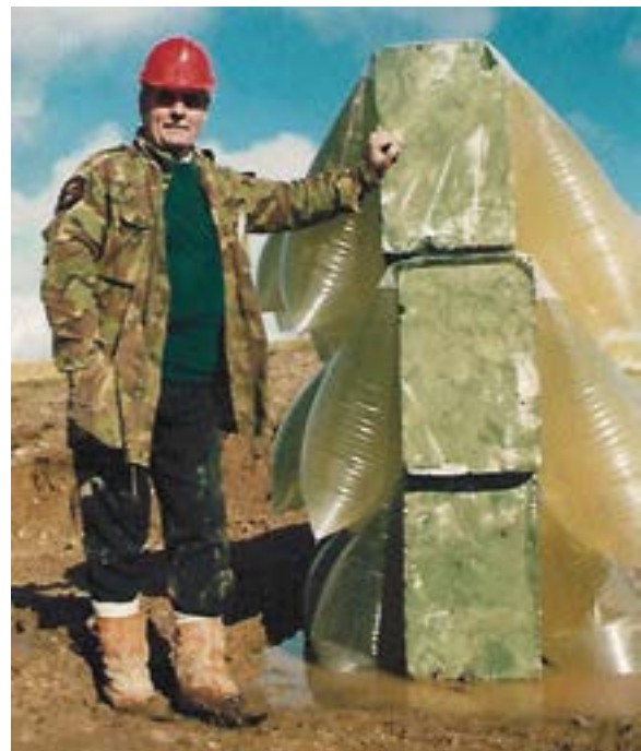
Image 2. Saddle bag and polystyrene construction.

will increase ground shock, but this could perhaps be reduced by a surrounding ditch. The key problem has been to build water bag structures with height. It is possible to draw systems in which the skin tension defines the shape but it is difficult to control the shape of a partly filled structure. A water bag can roll down imperceptible slopes, and the incompletely filled structures can show maddening behavior. Expanded polystyrene foam, glass-fiber tubes in the form of hollow rectangular