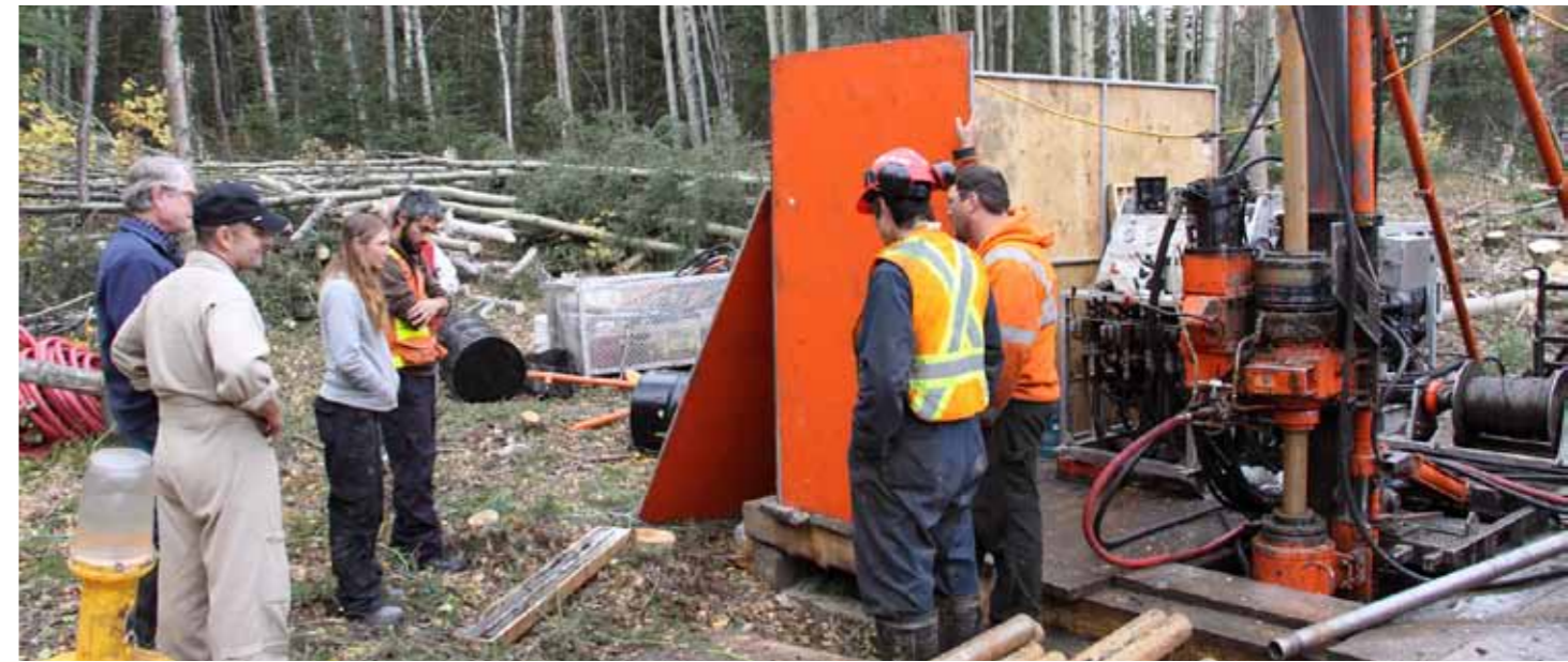
2012 summer drilling program

Situated within an active mining area, where other players are mining oilsands as opposed to metals, and with access to considerable existing infrastructure, the