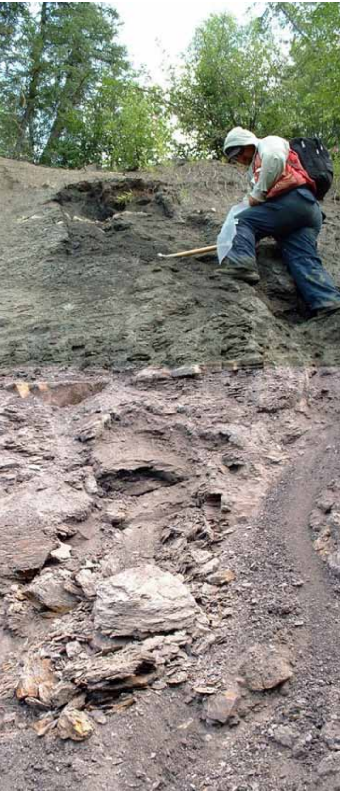
Geo mapping sampling another vertical cliff face outcrop of the black shale