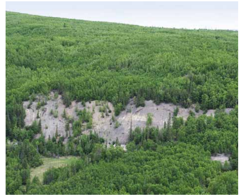
Aerial view of ridgeline shale outcrop

“DNI Metals is an exploration and development company, not a mining