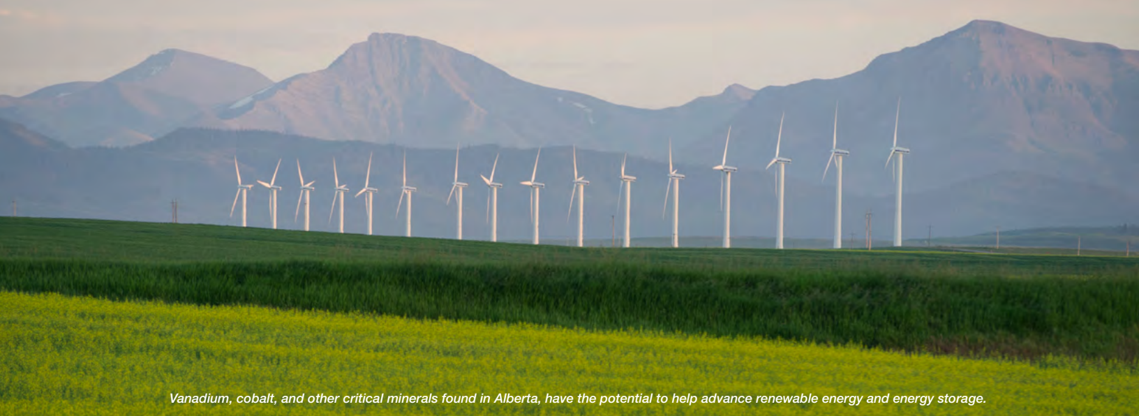
Vanadium, cobalt, and other critical minerals found in Alberta, have the potential to help advance renewable energy and energy storage.