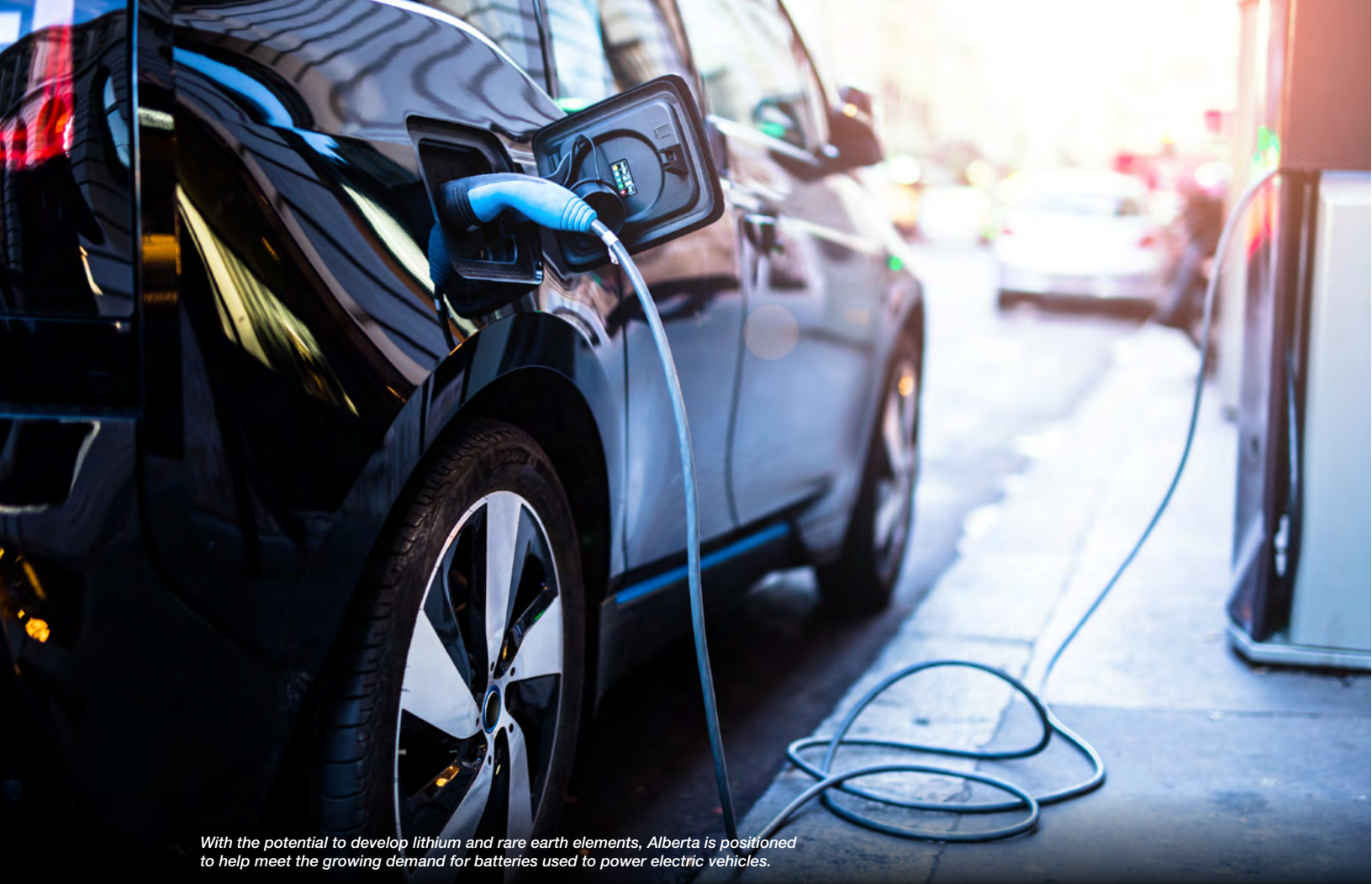
With the potential to develop lithium and rare earth elements, Alberta is positioned to help meet the growing demand for batteries used to power electric vehicles.