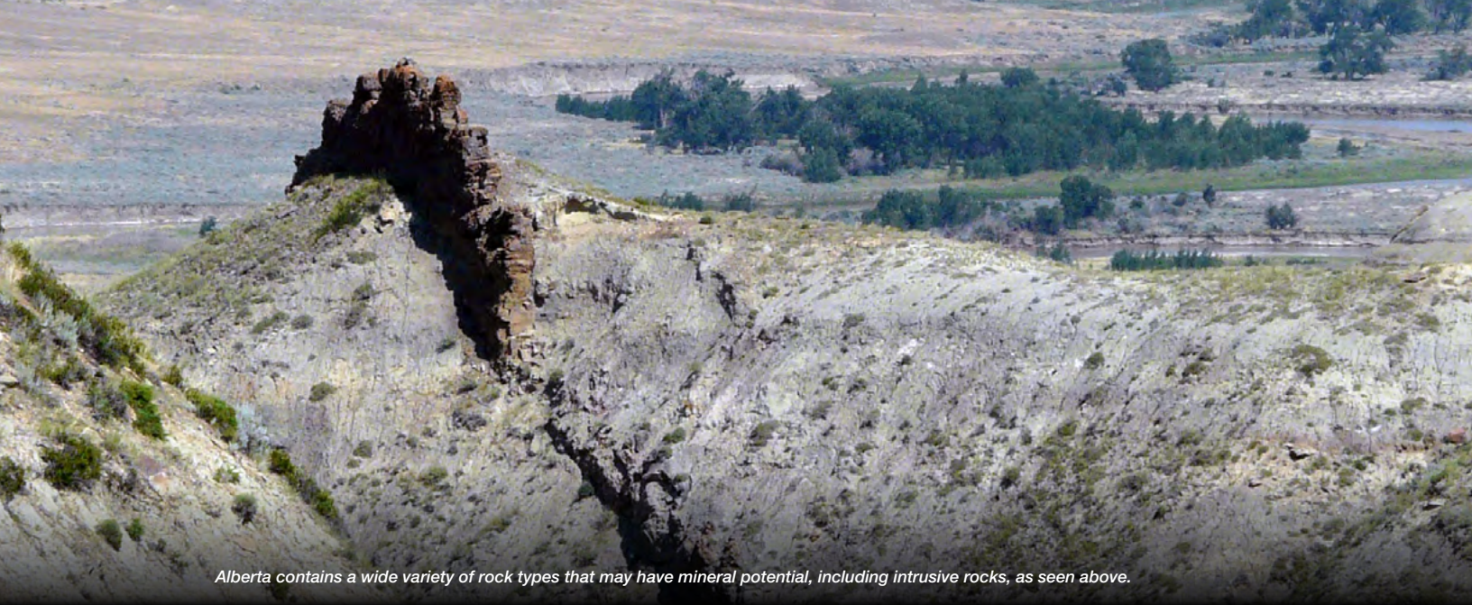
Alberta contains a wide variety of rock types that may have mineral potential, including intrusive rocks, as seen above.