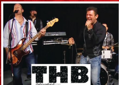
Saturday, July 12 • 6-10 The House Band