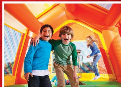
Bounce Houses, Carnival Games & Face Painting