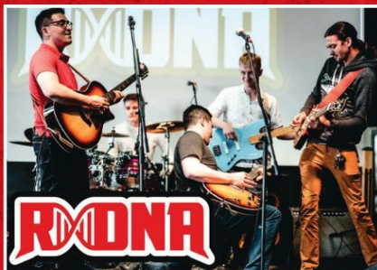
Sunday, July 13 • 3-6 RDNA