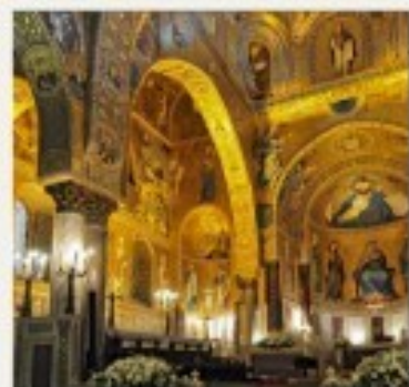
Church of the Martorana Sicily