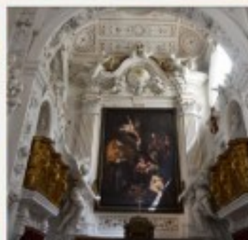
Oratory of San Lorenzo Sicily