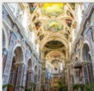
Casa Professa Church of Jesus Palermo, Sicily