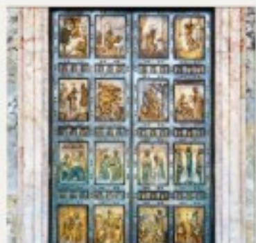
Holy Doors Rome, Italy