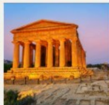
Valley of the Temples Sicily