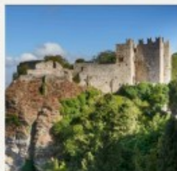
Medieval Village of Erice Sicily