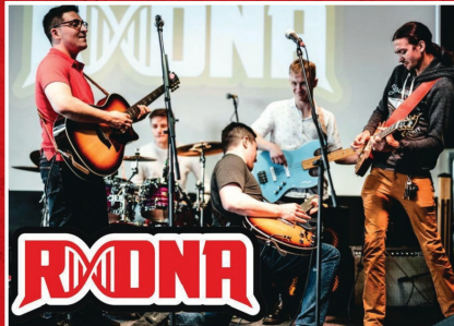
Sunday, July 13 • 3-7 RDNA