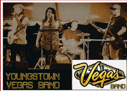
Saturday, July 12 • 6-10 The Vegas Band