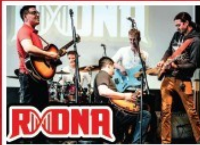
Sunday, July 12 • 4-7 pm RDNA