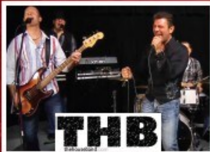
Sat., July 11 • 6-10 pm The House Band