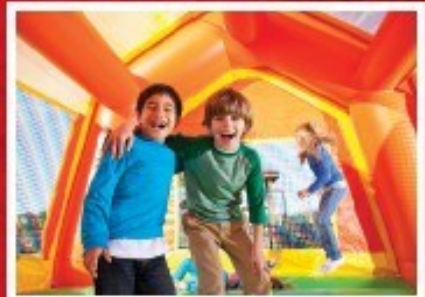
Bounce House and Games for Kids