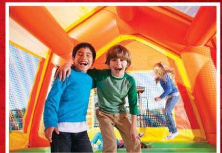
Bounce Houses, Carnival Games & Face Painting