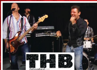
Saturday, July 12 • 6-10 The House Band