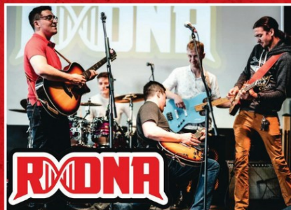
Sunday, July 13 • 3-6 RDNA