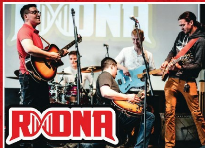
Sunday, July 13 • 3-7 RDNA