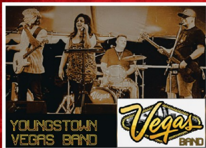
Saturday, July 12 • 6-10 The Vegas Band