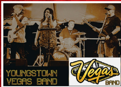
Saturday, July 12 • 6-10 The Vegas Band