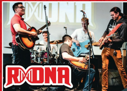
Sunday, July 13 • 3-7 RDNA