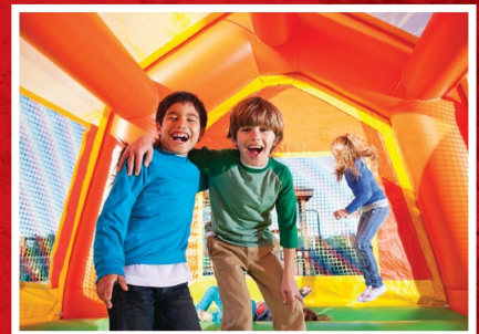
Bounce Houses, Carnival Games & Face Painting