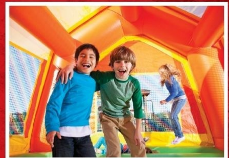
Bounce House and Games for Kids