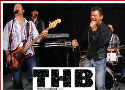
Sat., July 11 • 6-10 pm The House Band