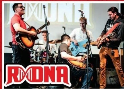
Sunday, July 12 • 4-7 pm RDNA