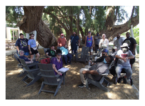
REN Staff & Members at Agritopia

Services, and explored Tonto National Monument during the week. Toward the end of the month, RST students celebrated their graduation.