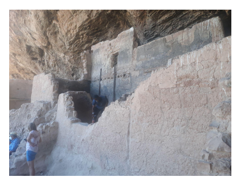
- Tonto National Monument