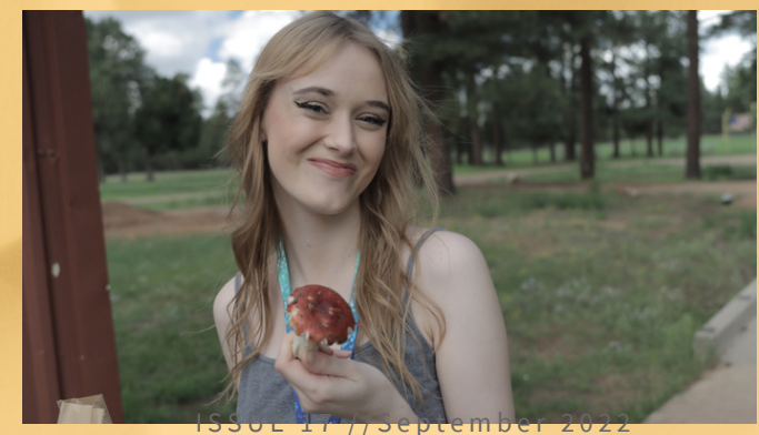
THE OFFICAL PAPER BROUGHT TO YOU BY PEERS