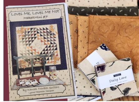
Make It Mini #7 Kit 24" x 24" mini quilt

This palette of 24 hues includes 5 brand-new, limited-edition 50wt colors exclusive to this calendar and 5 new intro shades of 8wt and a medley of Aurifil's cotton thread weights. Also included - 14 small spools of varying colors & weights.