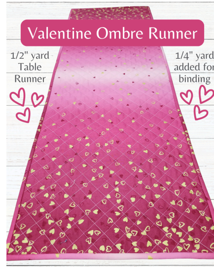
Valentine Ombre Runner