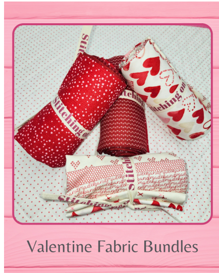
Valentine Fabric Bundles