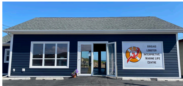
Lobster Interpretive Marine Life Centre - July 2023