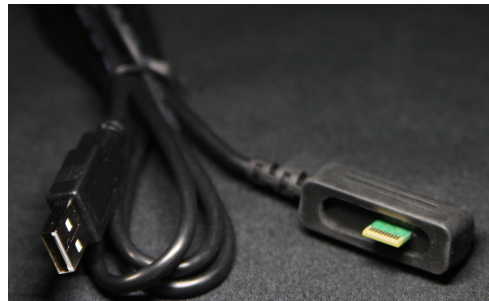
Custom medical cable requiring dust ingress protection