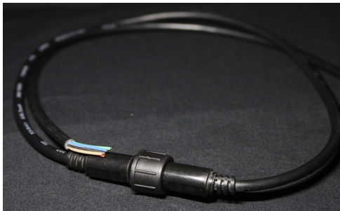
Cable Assembly using standard IP rated components