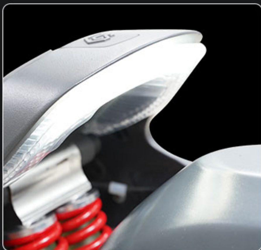
BUILT-IN INTEGRATED COOL LIGHTING