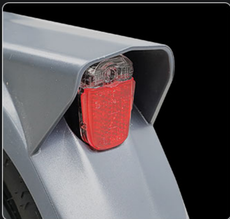
BRAKE FLASH REAR TAILLIGHT