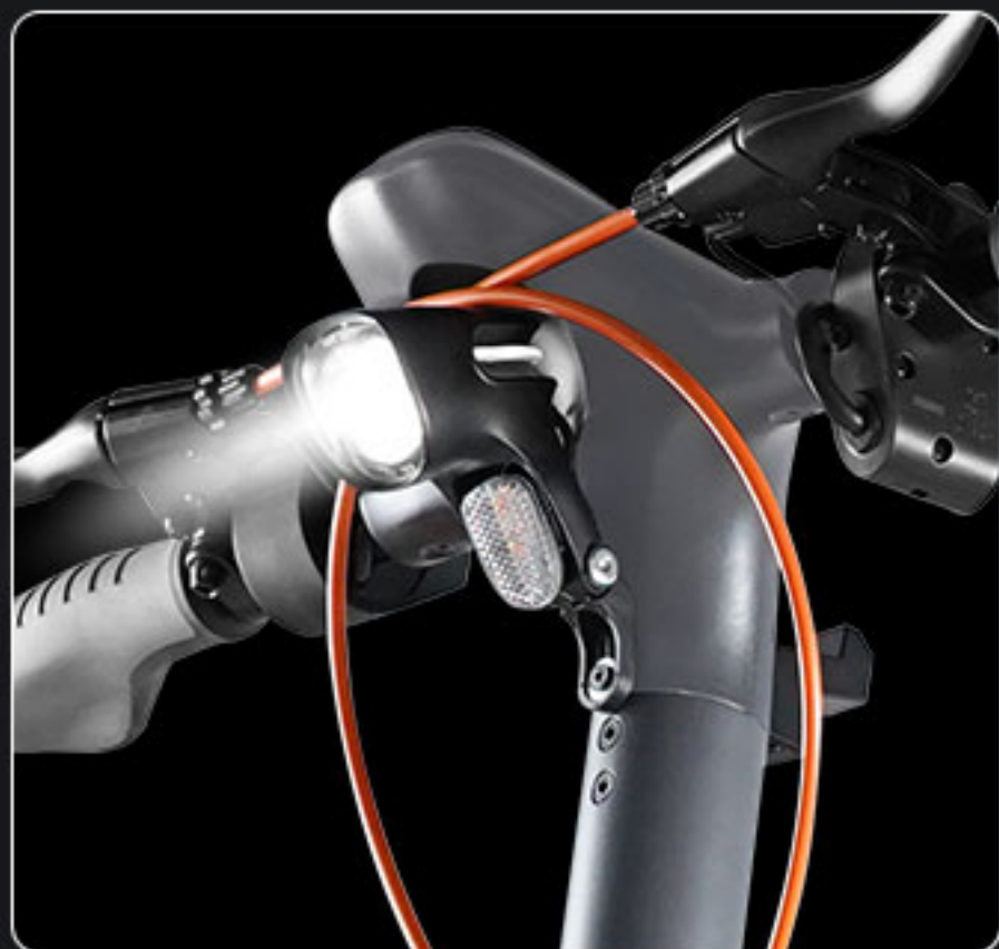
FRONT LIGHT AND TURN SIGNAL