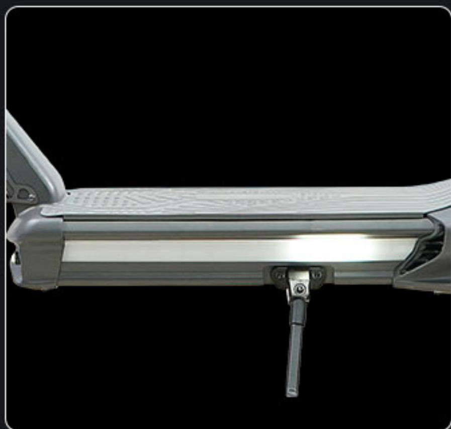
COOL WATER ATMOSPHERE LIGHT