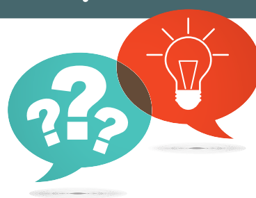
Figure out how many months it is going to take you to be ready for the exam, depending on how well you do on the practice tests.

REVIEW SAMPLE QUESTIONS ON THE GRE WEBSITE.