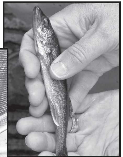
Lake Michigan Strain Walleye