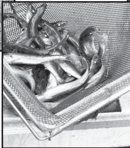
6"-9" Inch walleyes are netted and released in Swan Lake

Swan Lake residents and several SLA Board members watch the release of 3000 walleye at the public boat landing on Saturday November 1st.