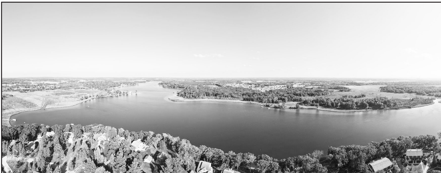
Swan Lake from Northwest