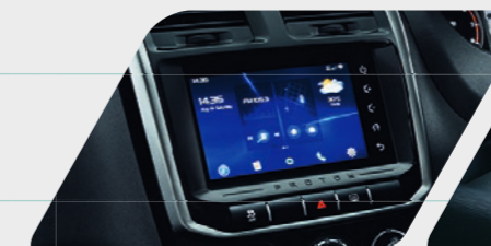
7" Infotainment Head Unit