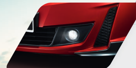
LED Daytime Running Lamps