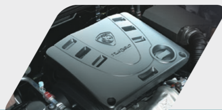
1.6L Turbo Engine

Powered by a turbocharged engine and PROTON's signature ride and handling, it is satisfaction at every drive.