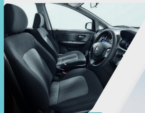
1.6T Executive CVT Fabric