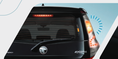
Emergency Stop Signal