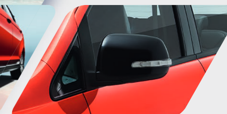
Electric Fold Door Mirrors