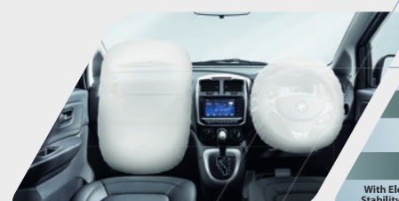
Front SRS Airbags