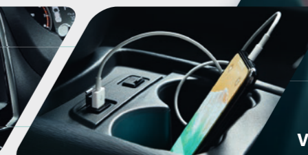
2 USB Ports