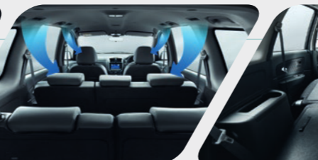
2nd & 3rd Row Air Vents