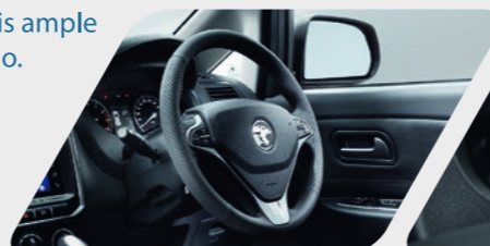
Leather Steering Wheel with Switches