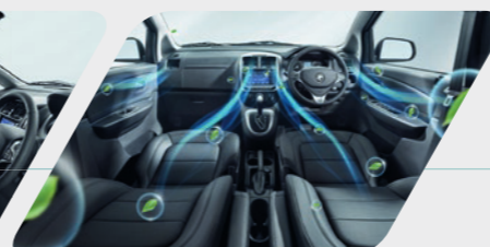
N95 Cabin Filter