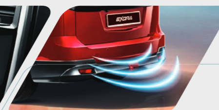
Rear Parking Sensors