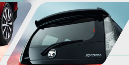
Rear Spoiler with Black Rear Garnish