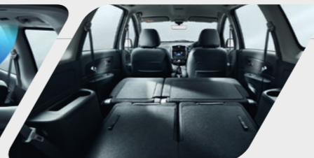
Rear Trunk Space