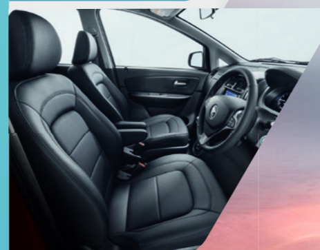
1.6T Premium CVT Leatherette