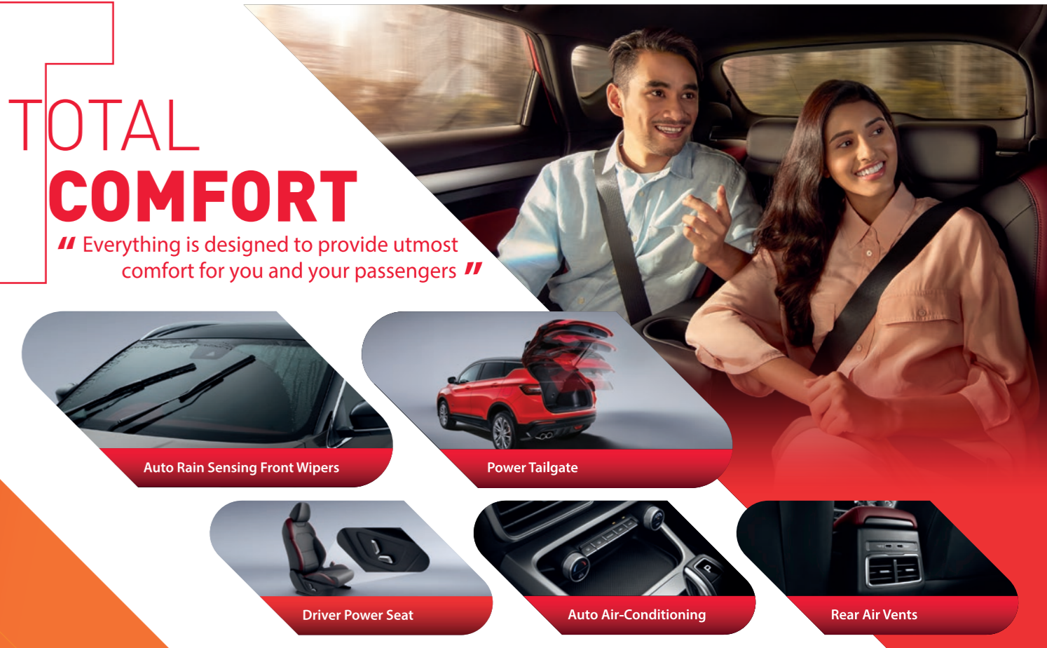
Auto Rain Sensing Front Wipers

“ Everything is designed to provide utmost comfort for you and your passengers ”