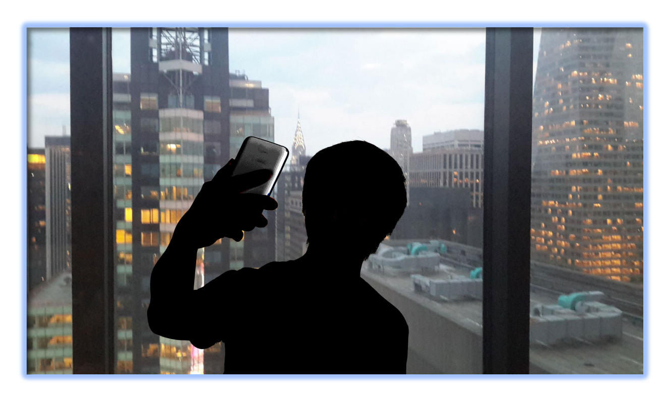
To see The Phantom of the Opera, <u>turn to page 26</u>