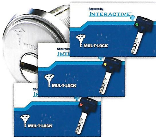
High Security Coded Cards... for Enhanced Key Control